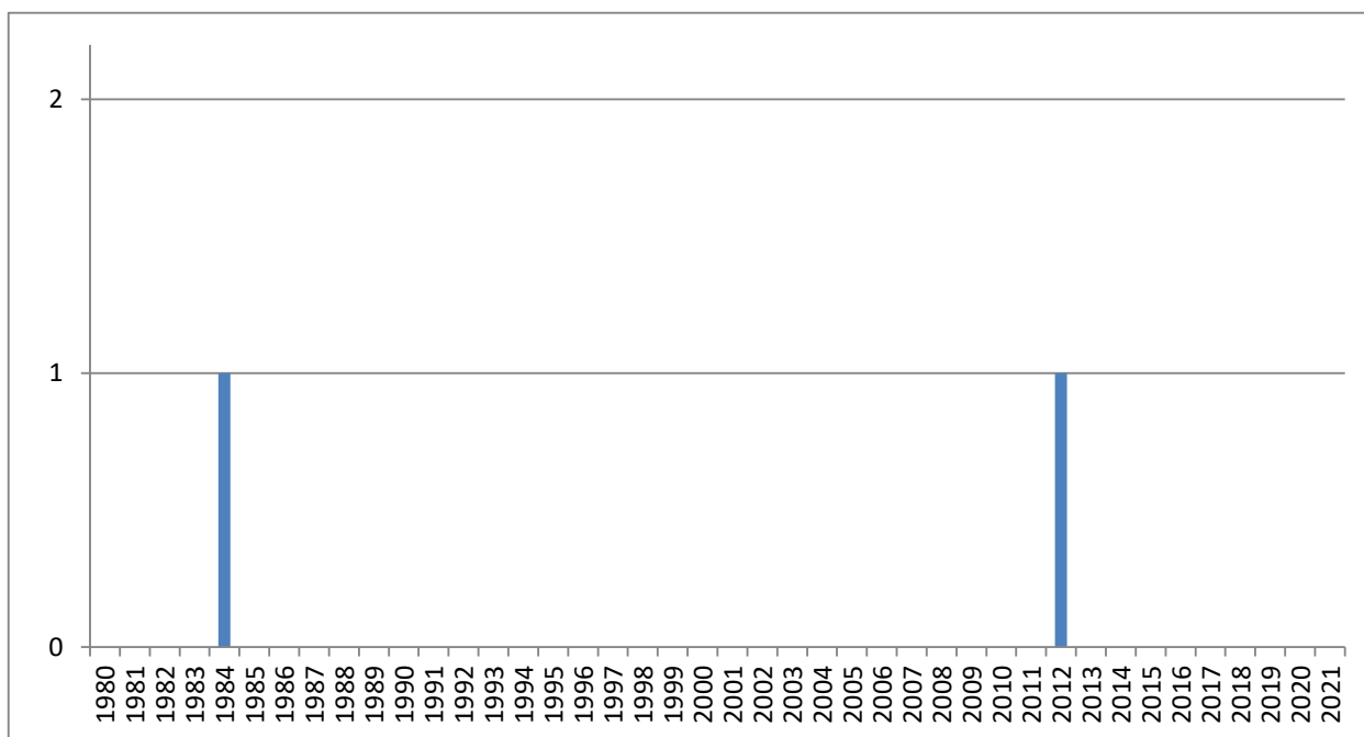
Figure 1: Barred Warbler records at Folkestone and Hythe

The records by year are shown in figure 1.