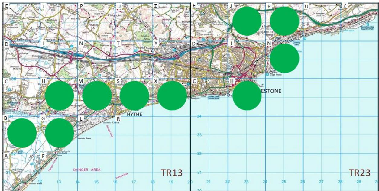
Figure 3: Distribution of all Hawfinch records at Folkestone and Hythe by tetrad

The two most recent records were also in gardens: in Saltwood in March 2021 and central Folkestone in April 2022. Figure 3 shows the location of records by tetrad.