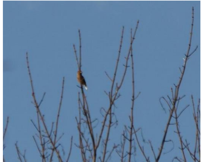
Hawfinch at Burmarsh (Brian Harper)

Well-distributed across Europe, only really being absent from Ireland and more northern areas such as northern Scotland, northern Fenno-Scandia and northern Russia. The northern populations migrate more than the southern ones which are largely sedentary. Juveniles migrate more than adults, and females more than males. Many birds move south-west across Europe, and winter chiefly in southern France, north-east Spain, northern and central Italy and the Balkans. Some cross the Mediterranean Sea to the Balearic Islands, Sardinia and Corsica.