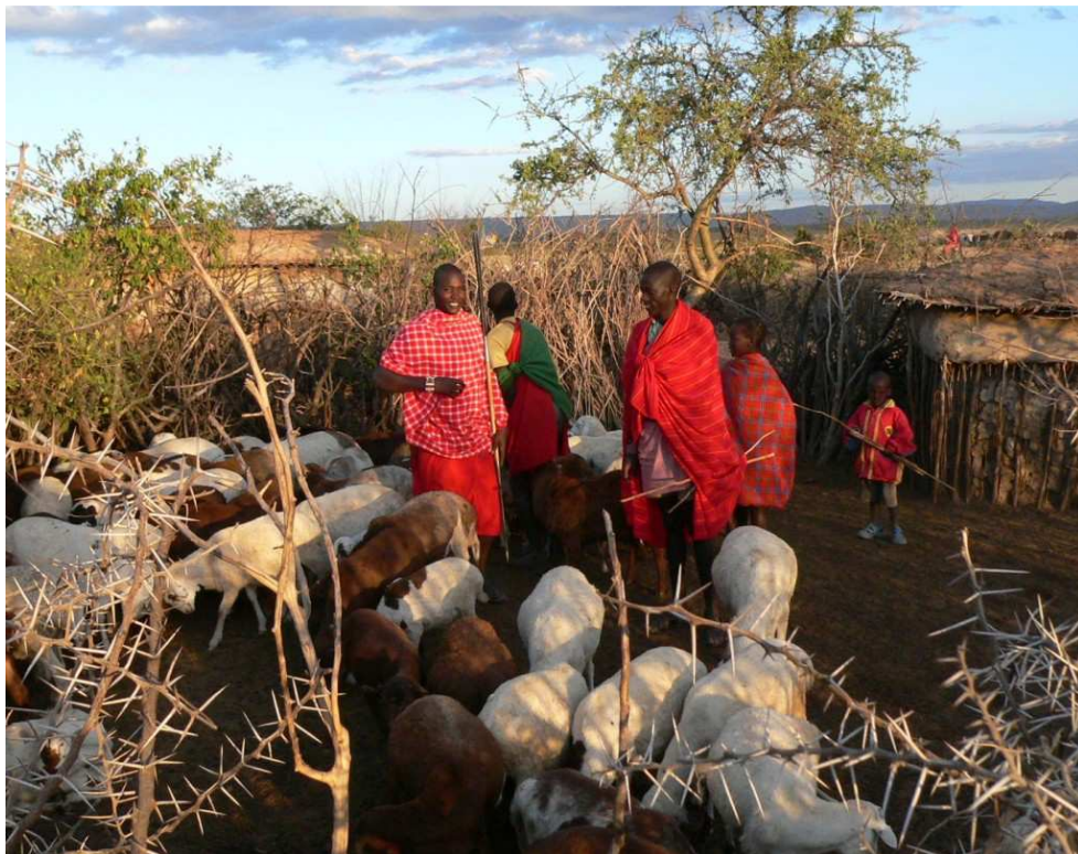
Sheep safely in for the night - notice the thorns on the fence!