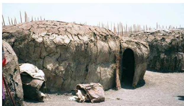
A Maasai house

Look at the Group Orders and find out what you can do to get yourself out of this mess and back to the Samburu Game Lodge – in one piece!