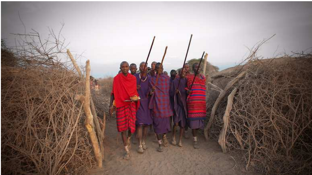
These Maasai men are at the entrance to their enkang

This is a Maasai village seen from the air - it is called an enkang. The Maasai are cattle and sheep herders and in the picture you can see the houses and the pens for the animals. The houses are made from a wooden frame covered over with mud and cow dung. The fence around the enkang is made of thorn bushes and keeps the wild animals out at night.