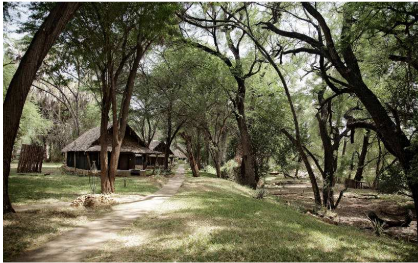
This is the Samburu Game Lodge – you need to get there.