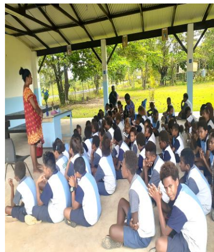
Grade 2 leads Primary School in saying the Rosary