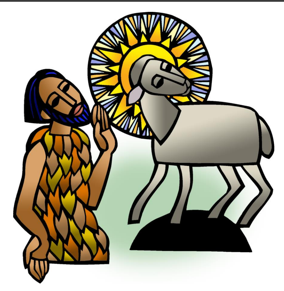
Service of the Word Weekly Resource for Prayer and Devotions at Home