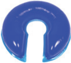
BD2170 Adult Horseshoe Head Donut 8"OD x 3"ID x 1.75"H