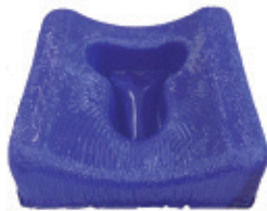
BD2191 / BD2192 Richards Headrest 9"L x 8"W x 3"H (BD2191) 9"L x 8"W x 4.5"H (BD2192)