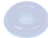
BD2160 Medium/Pediatric Head Donut 5.5"OD x 2.25"ID x 1.25"H