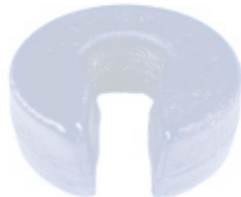
BD2170-T Adult Horseshoe Head Donut (Tall) 7.75"OD x 4"ID x 3"H