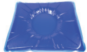
BD2180 / BD2185 Head Pillow w/Centering Dish 9"L x 10"W x 1"H (BD2180) 9"L x 10"W x 1.75"H (BD2185)