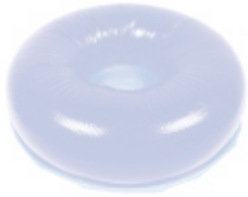
BD2150 Adult Head Donut 8"OD x 3"ID x 1.75"H