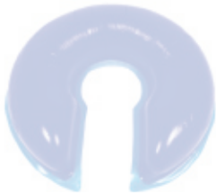
BD2170 Adult Horseshoe Head Donut 8"OD x 3"ID x 1.75"H