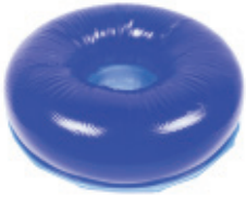
BD2150 Adult Head Donut 8"OD x 3"ID x 1.75"H