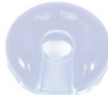
BD2220 Prone Headrest w/Tube Channels 8"OD x 3"ID x 3.5"H