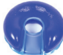
BD2220 Prone Headrest w/Tube Channels 8"OD x 3"ID x 3.5"H