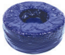
BD2150-T Adult Head Donut (Tall) 7.75"OD x 4"ID x 3"H