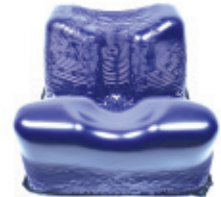
BD2225 Prone Gel Headrest w/Rigid Bottom 11"L x 9"W x 6"H