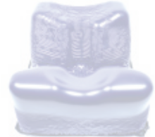
BD2225 Prone Gel Headrest w/Rigid Bottom 11"L x 9"W x 6"H