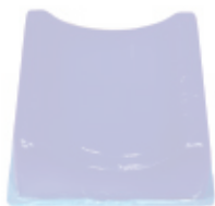
BD2190 Contoured Head Gel Pad 7"L x 7"W x 3.5"H (outer edge)