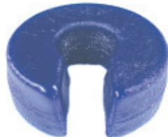
BD2170-T Adult Horseshoe Head Donut (Tall) 7.75"OD x 4"ID x 3"H