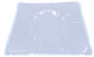
BD2180 / BD2185 Head Pillow w/Centering Dish 9"L x 10"W x 1"H (BD2180) 9"L x 10"W x 1.75"H (BD2185)