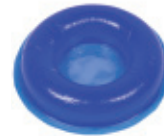
BD2160 Medium/Pediatric Head Donut 5.5"OD x 2.25"ID x 1.25"H