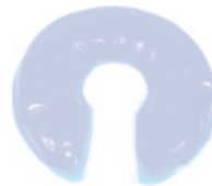
BD2175 Medium/Pediatric Horseshoe Head Donut 5.5"OD x 2.25"ID x 1.25"H