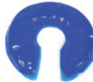
BD2175 Medium/Pediatric Horseshoe Head Donut 5.5"OD x 2.25"ID x 1.25"H