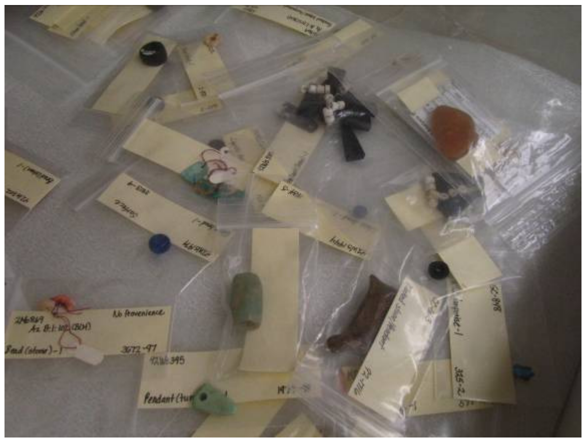
Examples of Jewelry in their sample drawer