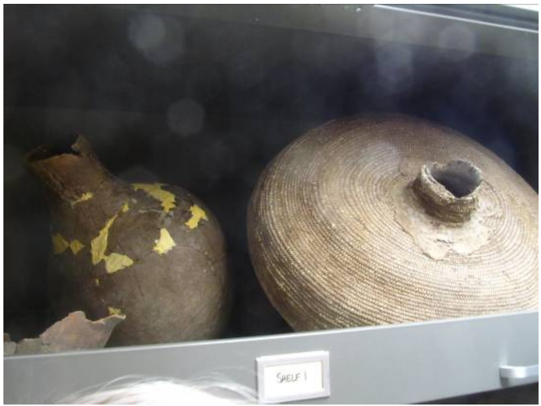
A large basket on the right and a reconstructed pot on the left