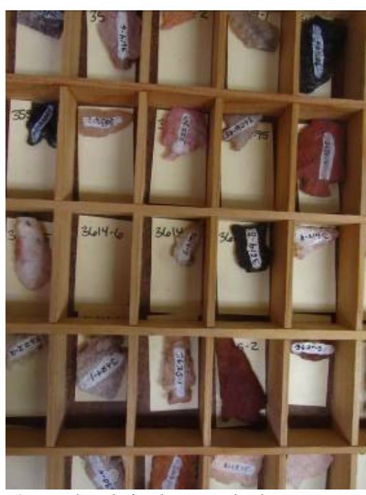
Arrow heads in the sample drawer