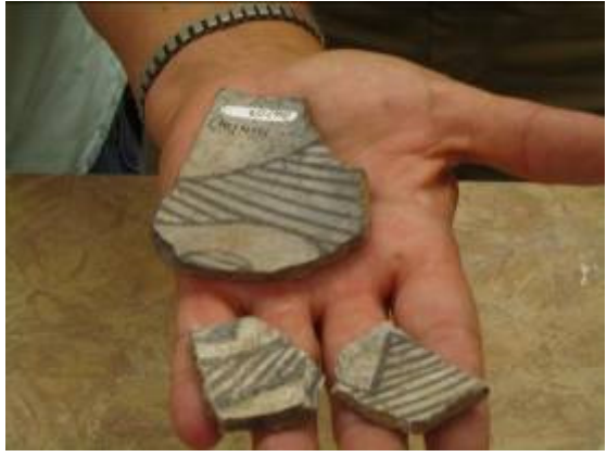
Shards – here were drawer after drawer of shards (not shown)