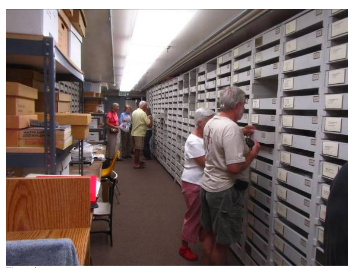
The main storage area

Most of the artifacts were stored in a floor to ceiling system of drawers. Some were stored in large metal cabinets.