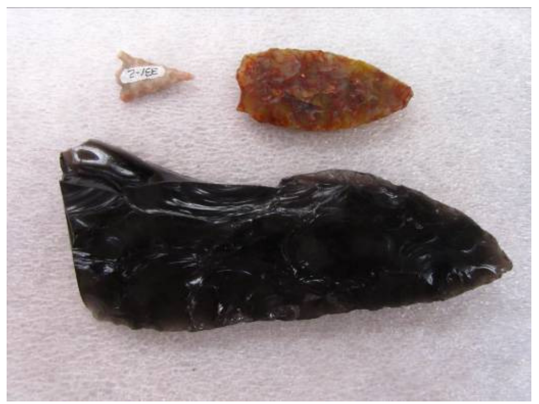
Points of various sizes – many points are made of Jasper and some of Obsidian (large black spear point)