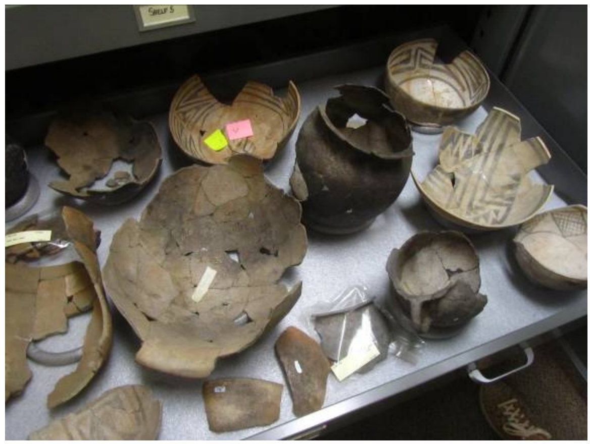
Reconstructed pots and some pot shards