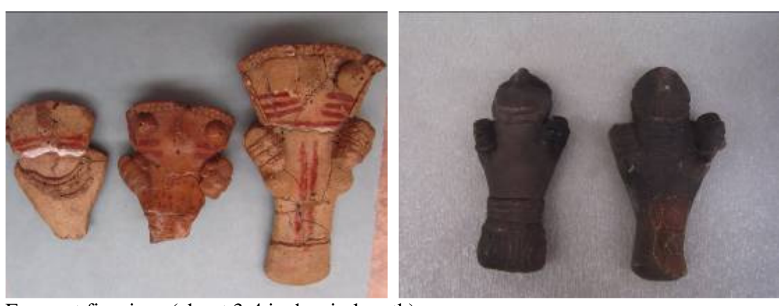
Fremont figurines (about 3-4 inches in length)