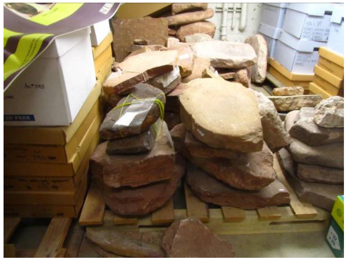
Matates stacked in a corner of the store room. There were drawers of small tools (not shown)