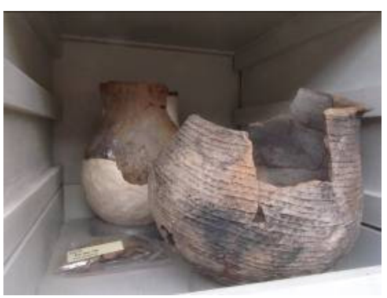
Partially reconstructed pot