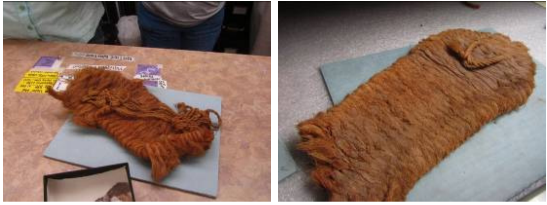
Two examples of a sandal – the one on the right appears more worn