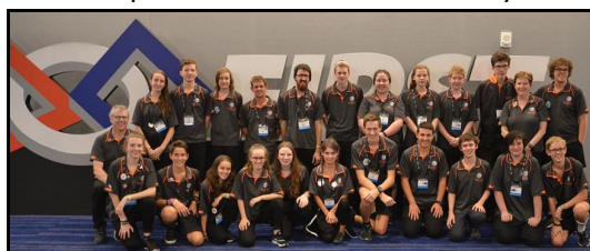
ICRobotics Team 5584

ICRobotics Team 5584 said, "The entire experience of representing Australia on the world stage was incredible. We were able to gain unforgettable life skills and memories of a lifetime. Thank you Tyabb Ratepayers for supporting us as we competed at this level and continue to promote STEM in our community."