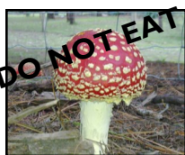
Fly Agaric (Amanita muscaria)

After the Autumn break the Reserve is looking great; not just green, but splashed with orange, red, white and buff as the multitude of different fungi that thrive there put up their fruiting bodies. Some look like mushrooms, others like corals, but all are fascinating. But, beware, there are some extremely poisonous ones, so don't be tempted to indulge in any gastronomical experimentation.