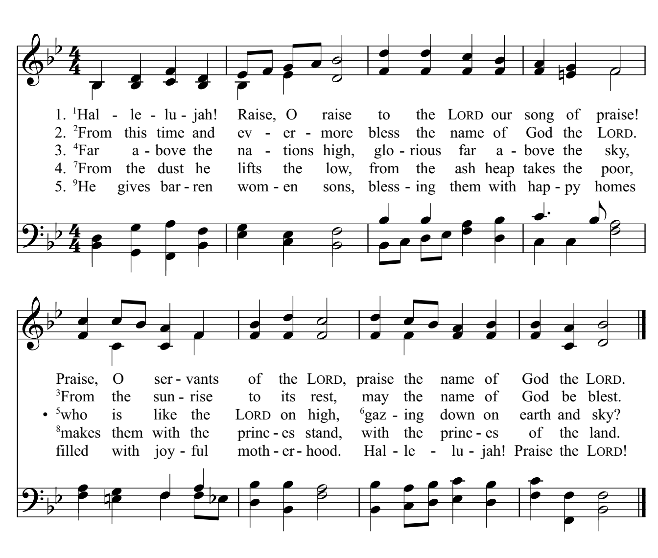
~ God Answers His People and Speaks in the Scripture ~