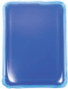
BD2300 Small Knee Crutch Pad 9"L x 11"W x 3/8"H