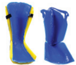
BD2325 / BD2326 Gel Stirrup Boot Liners Bell Shaped BD2325: Universal Fit BD2326: Fits Allen® Pal Pro Pairs