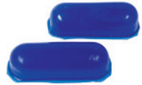
BD2295 Heel Elevators/Lifts 6"L x 2"W x 1.75"H Pair