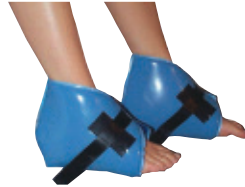
BD2290 Clamshell Heel Pad w/Velcro® .5" Thick Clamshell Each