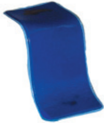
BD2280 Foot, Heel, and Sole Protector w/Velcro® 15"L x 6"W x .25"H