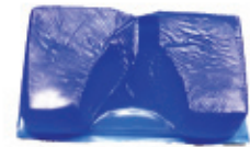
BD4502 Gel Heel Cup 6"L x 3"W x 1.5"H Each