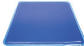
BD2320 Large Knee Crutch Pad 20"L x 20"W x .5"H