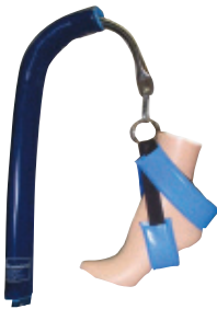
BD2330 / BD2335 Candy Cane Gel Pads BD2330: 24" Gel Sheath BD2335: Gel Ankle Protectors Pairs