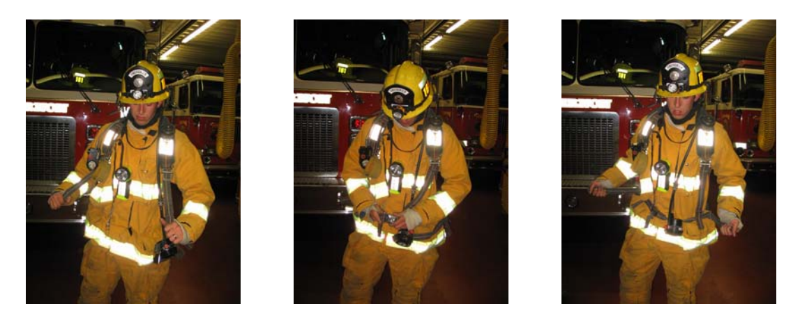
Allow the unit to slip down the back until stopped by the shoulder straps. Grasp the 2-3 inch tab extension and tighten the shoulder straps. Once tight buckle and tighten the waist straps. Finally, loosen the shoulder straps slightly to allow the pack to fall on your hips.