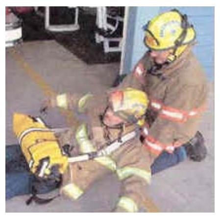
Secure the RIT Pak to the down firefighter if possible

The RIT Pak is designed to never have to leave the bag during normal operation. The High Pressure Bottle and Valve Assembly is accessible from the pull strap end of the bag. The opposite end contains a Velcro pouch, which houses the UAC Quick fill hose and coupling, as well as, the EBSS hose and Face Mounted Regulator and Mask Assemblies. To help secure the Velcro pouch, a seatbelt like strap buckles around the base of the RIT Pak.