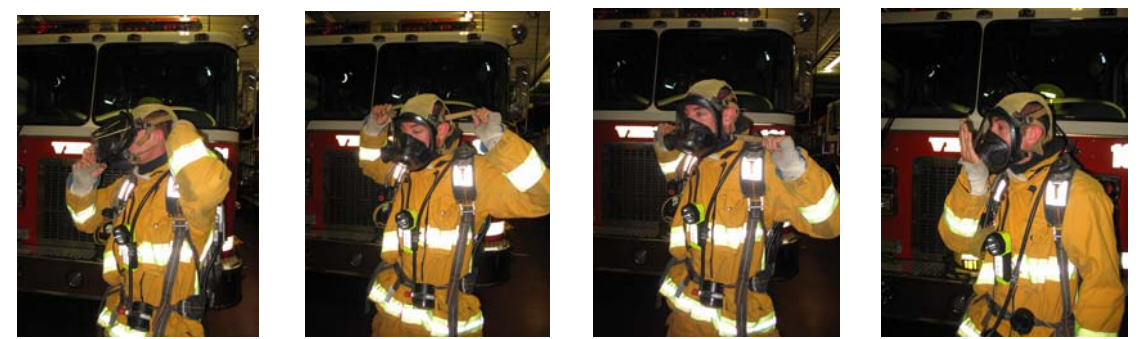
Hold the head harness out of the way with one hand, while placing the face piece on the face with the other hand. Pull head harness all the way back on your head. Tighten top straps and then tighten lower straps. Check face piece seal.