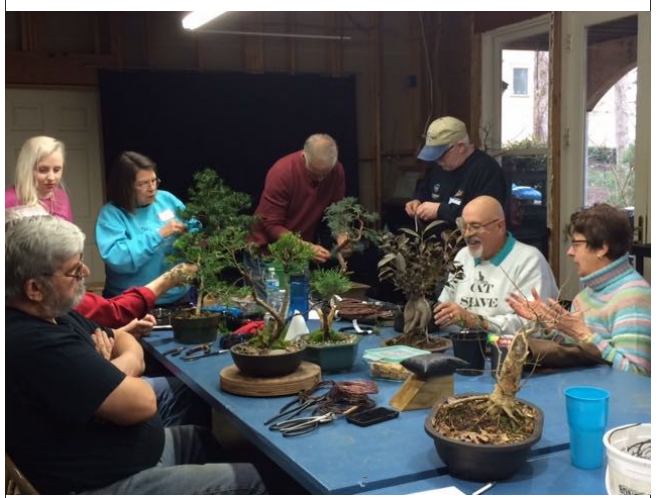
No better way to spend a Saturday afternoon than wiring trees in the company of fellow bonsai artists.

there was also a lot of guidance on pruning and shaping. Many of the trees needed both and some light pruning was required before wiring could even begin. A good meeting overall."