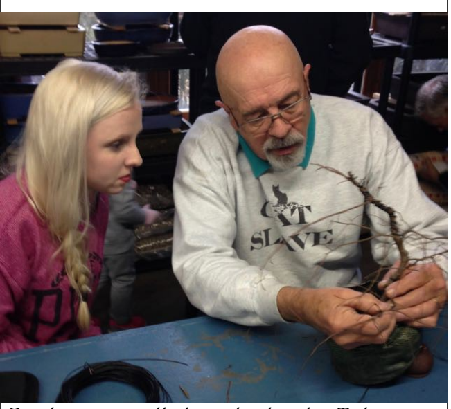
Good wiring is all about the details. Tedious, but necessary!