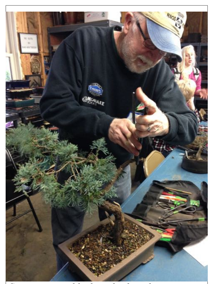
Creating natural looking deadwood requires practice.