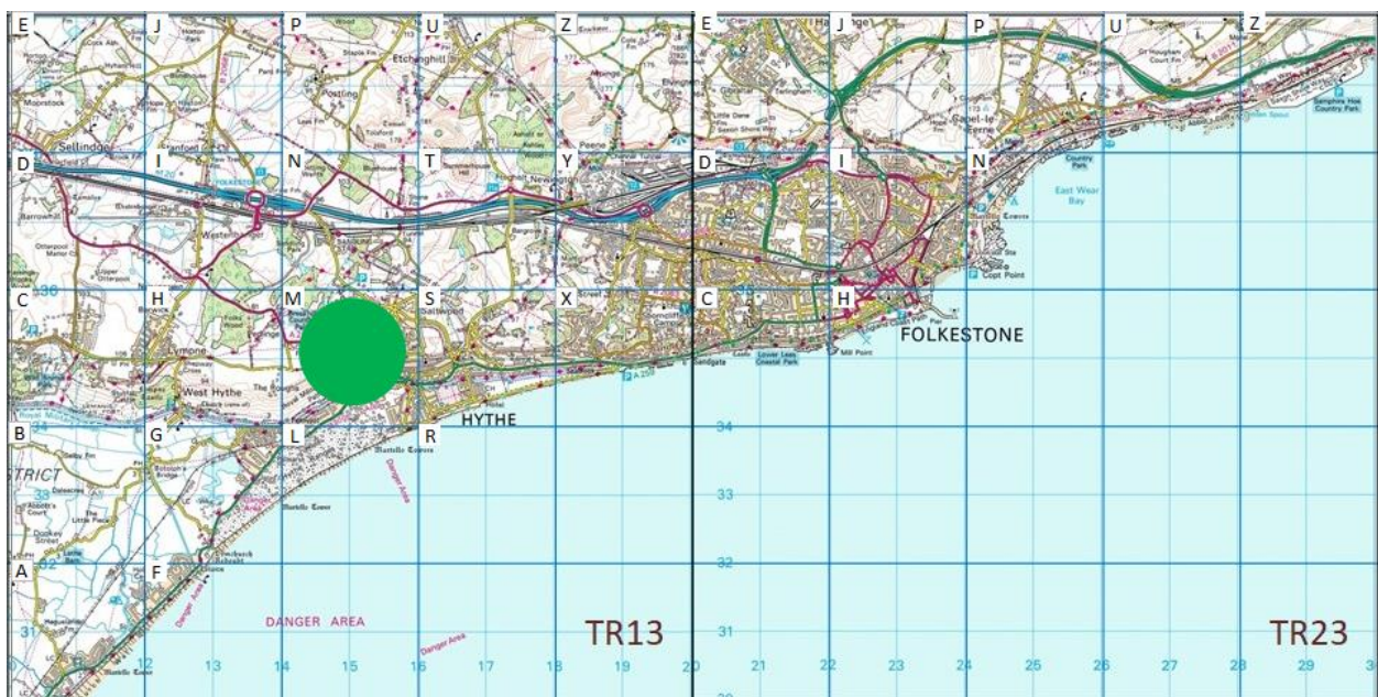
Figure 3: Distribution of all Collared Pratincole record at Folkestone and Hythe by tetrad

Figure 3 shows the distribution of the record by tetrad.