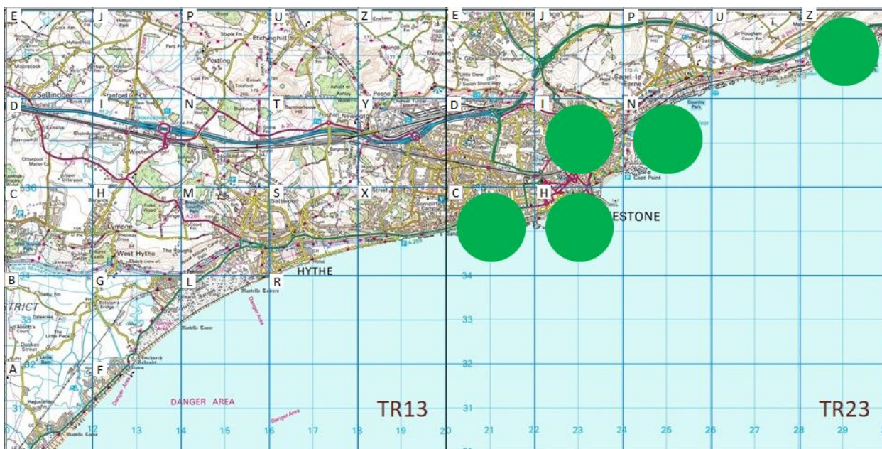
Figure 3: Distribution of all Long-tailed Duck records at Folkestone and Hythe by tetrad

Figure 3 shows the distribution of records by tetrad. Recent records have been seen from coastal watchpoints or in Folkestone Harbour. Most early records have not been mapped due to a lack of sufficient details to identify the tetrad of occurrence.