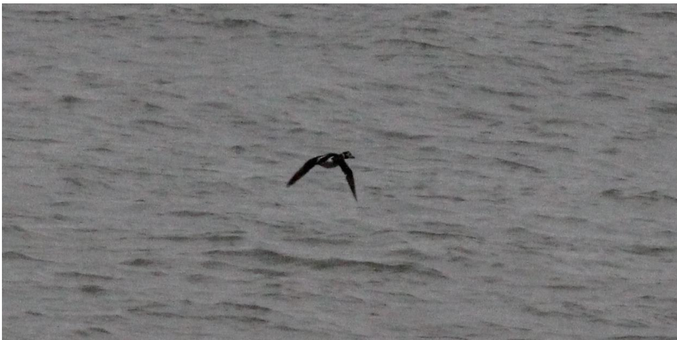
Long tailed Duck at Samphire Hoe (Ian Roberts)

The tetrad map images were produced from the Ordnance Survey Get-a-map service and are reproduced with kind permission of Ordnance Survey .