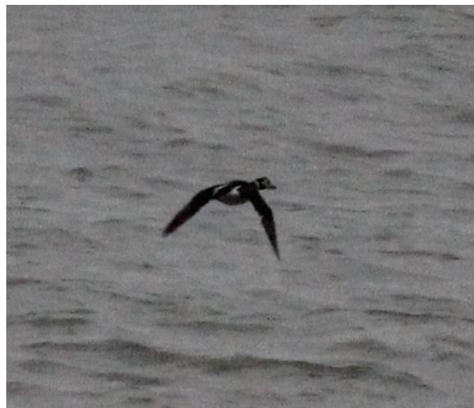
Long-tailed Duck at Samphire Hoe