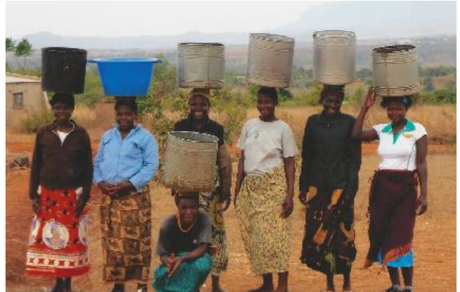
Local women carried the water nearly 1/2 mile (on their heads) to use for mixing the mortar.

IASE volunteers worked relentlessly at the building site for four hours each day for one week sorting and moving bricks for the bricklayers. This may sound like an easy job but it was back-breaking, especially since the average age of these women is 70 years! They were wonderful and in the process had the opportunity to meet many local women (employed by the builders to carry water in buckets on their heads!!) and children.