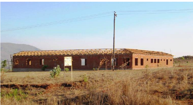
The building as it looks with the trusses...ready for a roof, windows and doors.