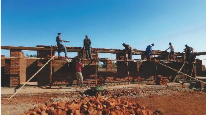
A local crew using minimal scaffolding to construct a wall of the building.

It is with great pleasure that we can report that the work on our 'inclusive' Vocational Training Centre (VTC) is progressing. As the pictures below demonstrate, the building is now up to the roofing stage. The roof trusses are up and the window frames and roof are the next to go up.