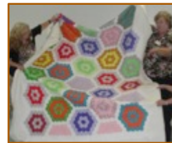
Bernice Zaidel's UFO Grandmother's Flower Garden Quilt