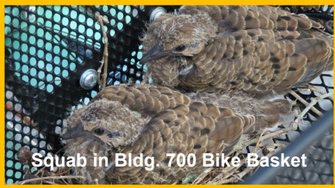
Squab in Bldg. 700 Bike Basket