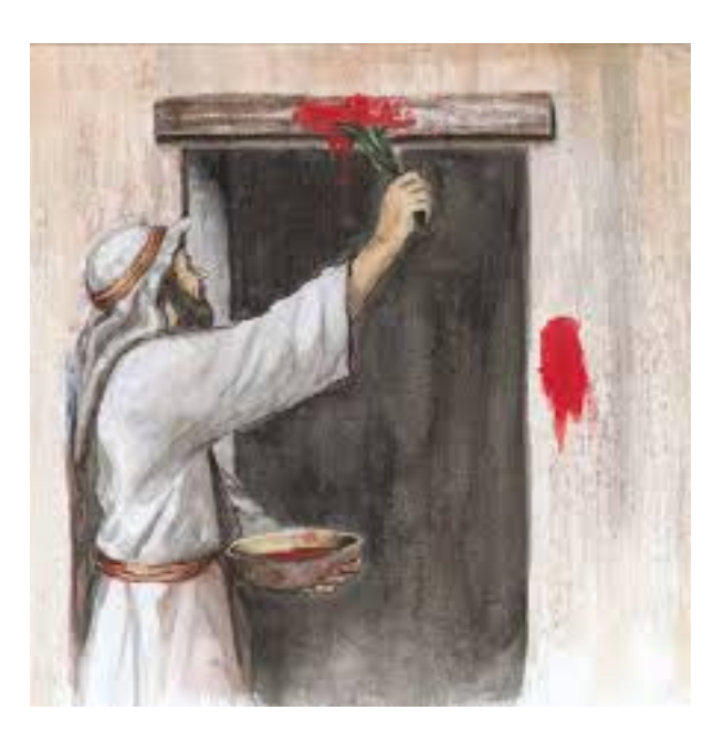
Gen. 19:2-3 "And he said, "Now behold, my lords, please turn aside into your servant's house, and spend the night, and wash your feet; then you may rise early and go on your way." They said however, "No, but we shall spend the night in the square." 3 Yet he urged them strongly, so they turned aside to him and entered his house; and he prepared a feast for them, and baked unleavened bread, and they ate." Gen. 19:8 "Now behold, I have two daughters who have not had relations with man; please let me bring them out to you, and do to them whatever you like; only do nothing to these men, inasmuch as they have come under the shelter of my roof."

We see in Genesis an example of the threshold covenant as it appears in scripture. Lot had two visitors come to talk to him. He invited them into his home and the moment they stepped across the threshold of his home they were under the protection of Lot.