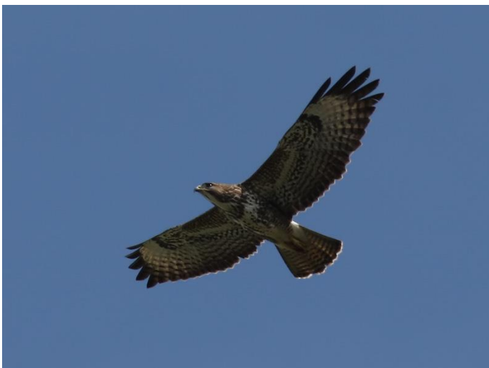
Buzzard at Sandling