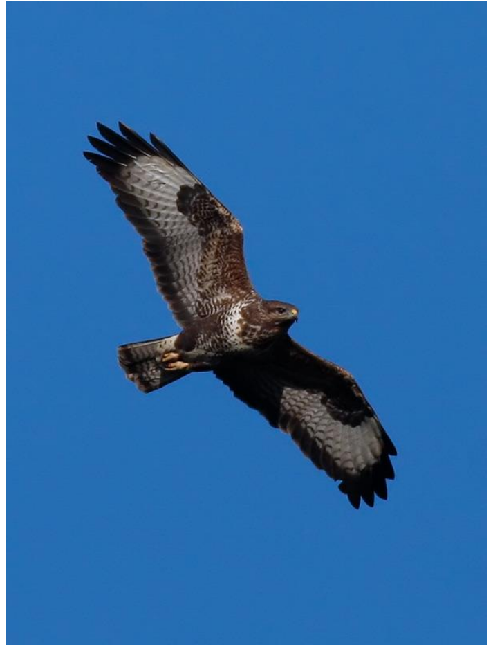
Buzzard at West Hythe