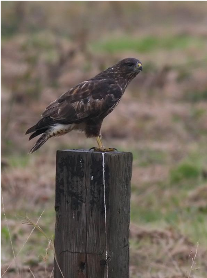
Buzzard at Botolph's Bridge