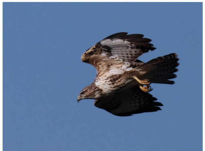
Buzzard at Creteway Down