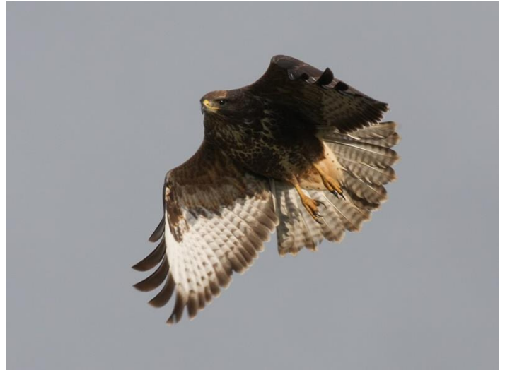
Buzzard at Botolph's Bridge (Brian Harper)

It is a rapidly increasing breeding resident in Kent, also a winter visitor and passage migrant.