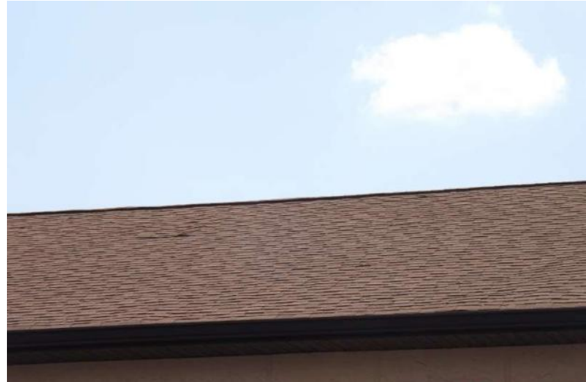
Asphalt/Fiberglass Shingle Roof Covering