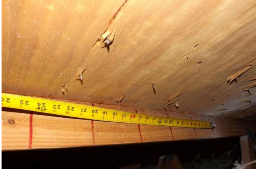
8d Nails Spaced 6" Along the Edge