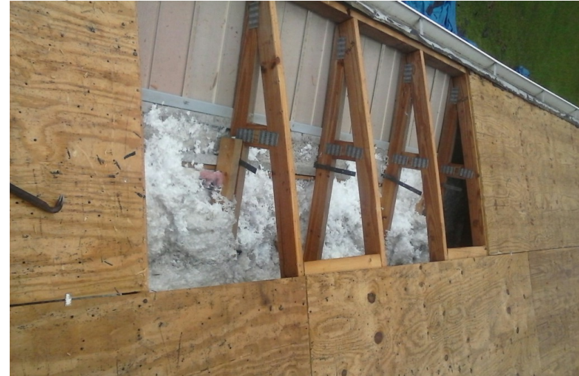
Hurricane Straps on the Trusses