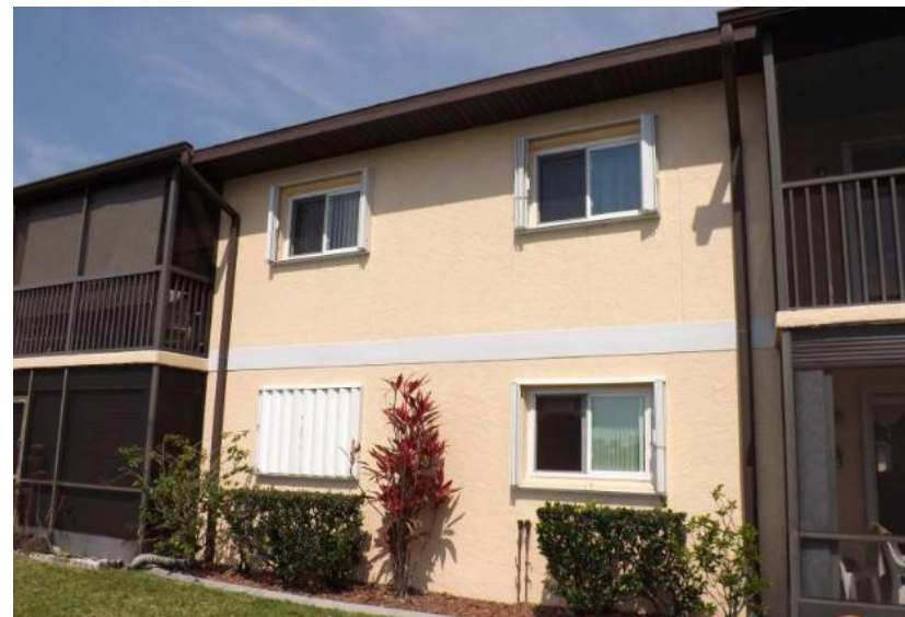
Impact Rated Accordion Shutters