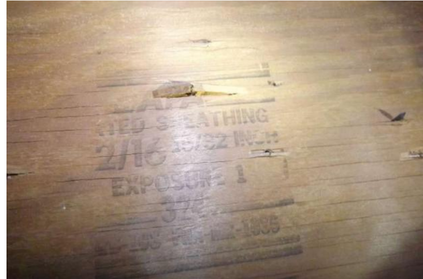
15/32" Deck Thickness Confirmed