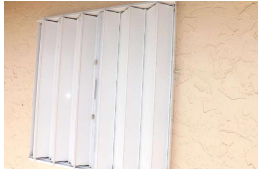
Impact Rated Accordion Shutter