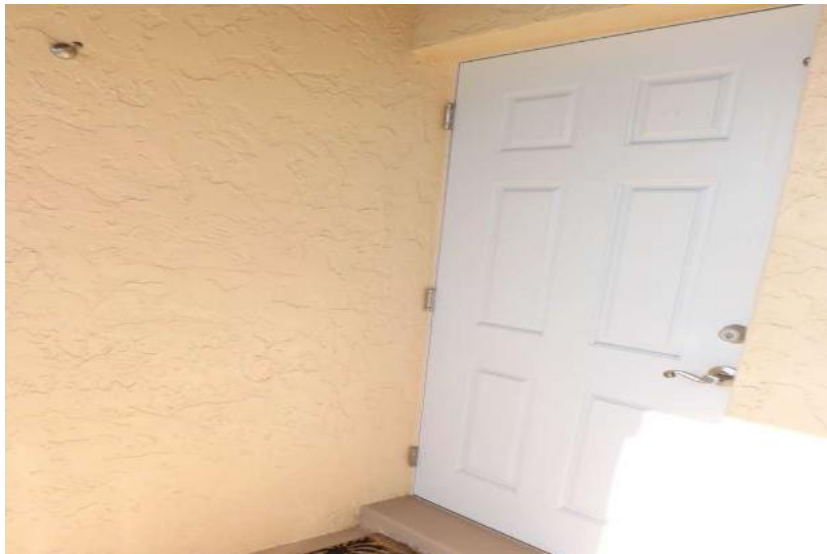
Impact Rated Solid Door - Product Approval FBC2001, FL4085