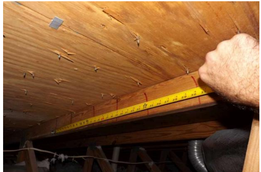
8d Nails Spaced 6" in the Field