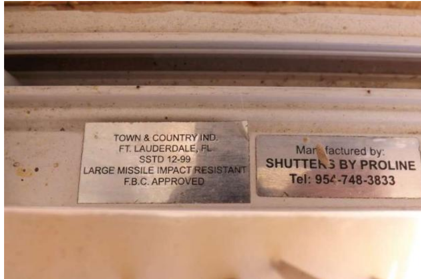
Impact Rated Accordion Shutter Label