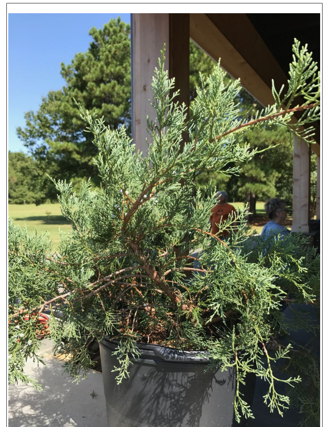
Sample of Juniperus virginiana 'Grey Owl' generously donated by DSBG.