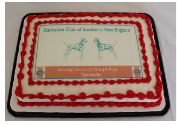
Above: Cake with banner displayed in the frosting.