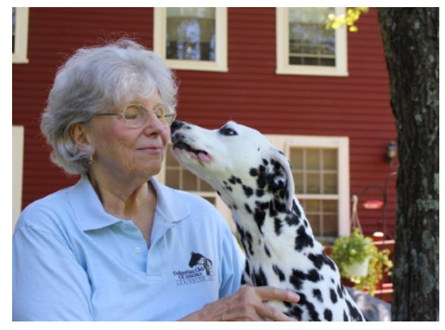
Happy 9th Birthday Ticket!