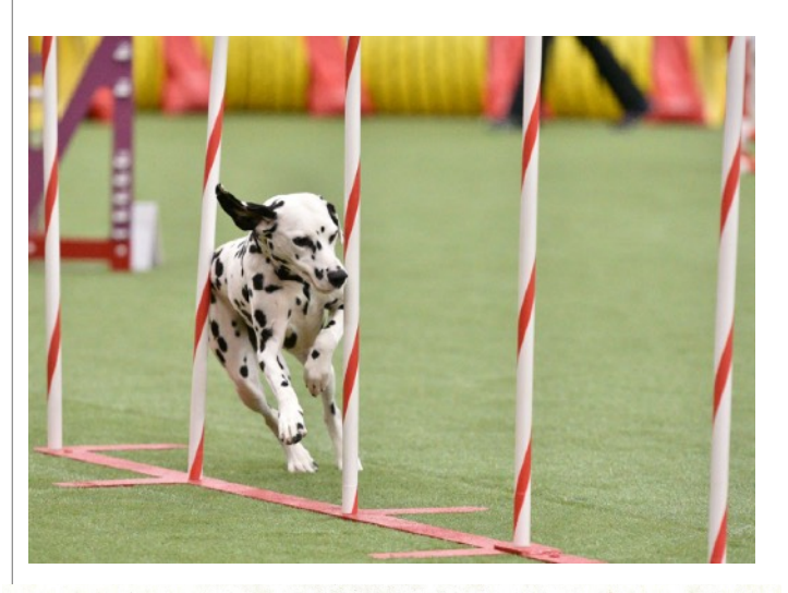
THE AMERICAN KENNEL CLUB is pleased to invite

#1 Dalmatian (Regular) MACH8 Riverside's N Onsengeltje Athena MXB3 PAD MJC3 PJD MXF T2B6 CA CGCA