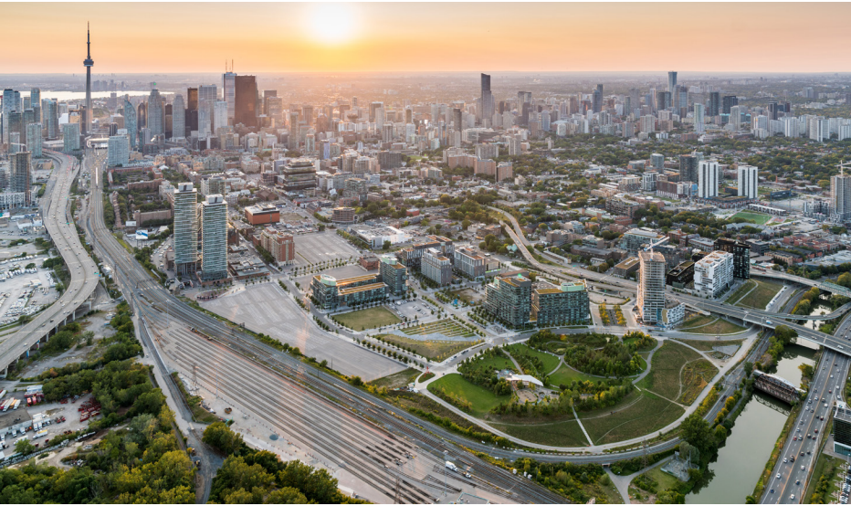
Canary District in the City