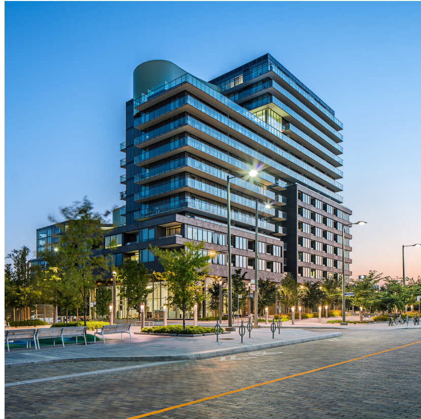
Canary Park Condominiums at Canary District