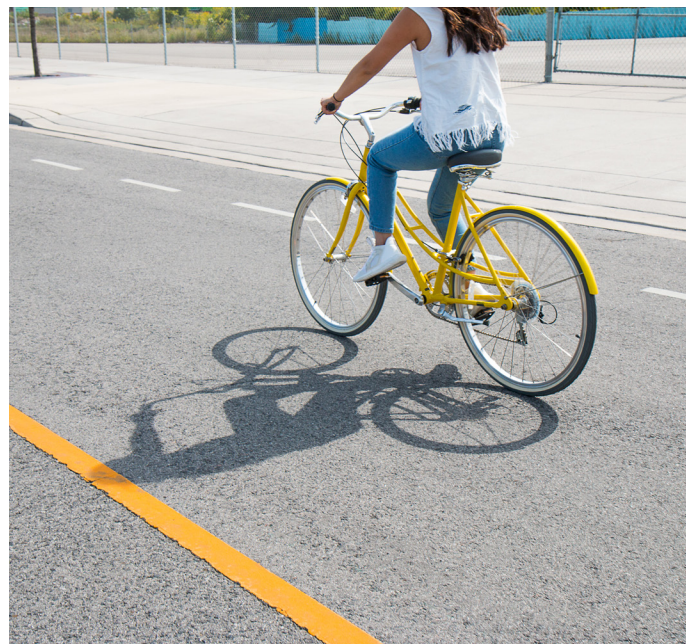
Cycling in Canary District Bike from Gears