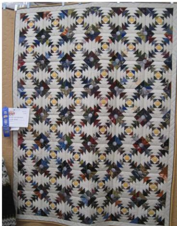
Lisa Dixon paper pieced with silk ties