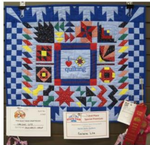
Sewcialbles group quilt