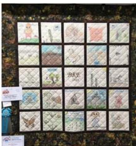
BKE 4th grade State of Idaho Quilt