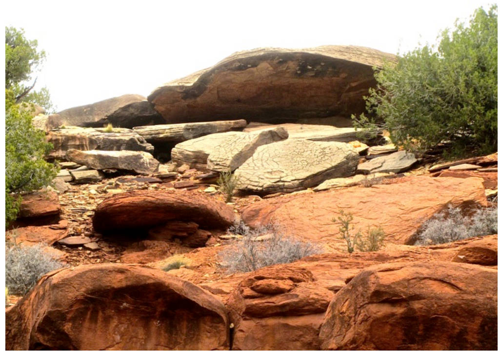
The Clamshell site