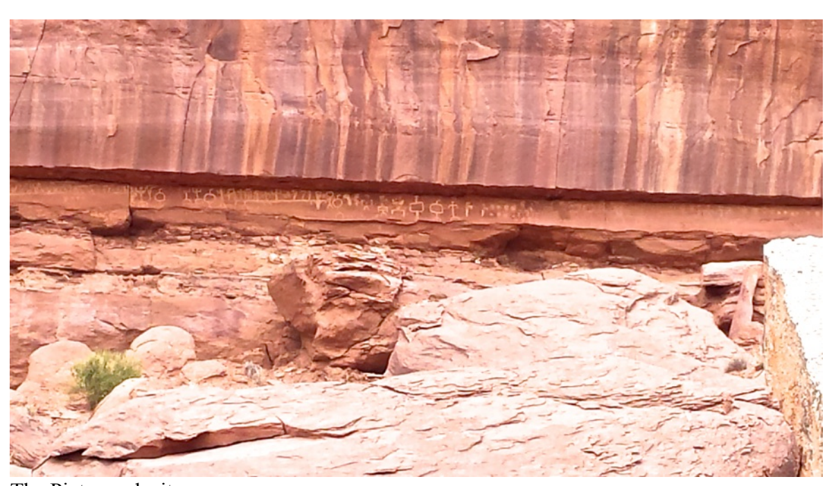
The Pictograph site

The February field trip was to two sites east of Fredonia Arizona plus a water glyph site on the Kaibab Paiute Reservation.