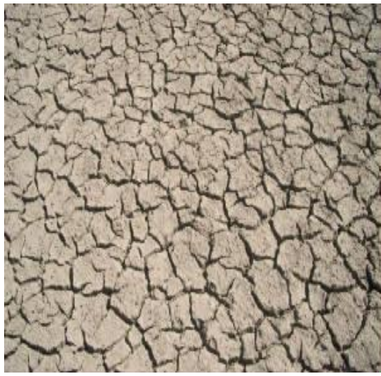
Parched earth resulting from a drought <a href="http://dampwater.tripod.com/id4.html">http://dampwater.tripod.com/id4.html</a>