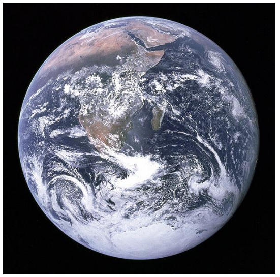
The Earth seen from Apollo 17 <a href="http://en.wikipedia.org/wiki/Holism">http://en.wikipedia.org/wiki/Holism</a>

In other words, "making sense" of something (learning) is a complex process of both connecting and contrasting ideas, of synthesis and analysis . Synthesis and Analysis are the backbone of all human understanding. Example: