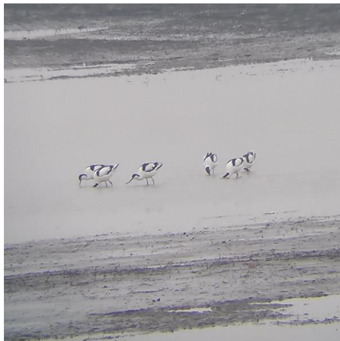
Avocets at the Willop Basin (Brian Harper)

In total there have been 76 area records. The full list of records is as follows: