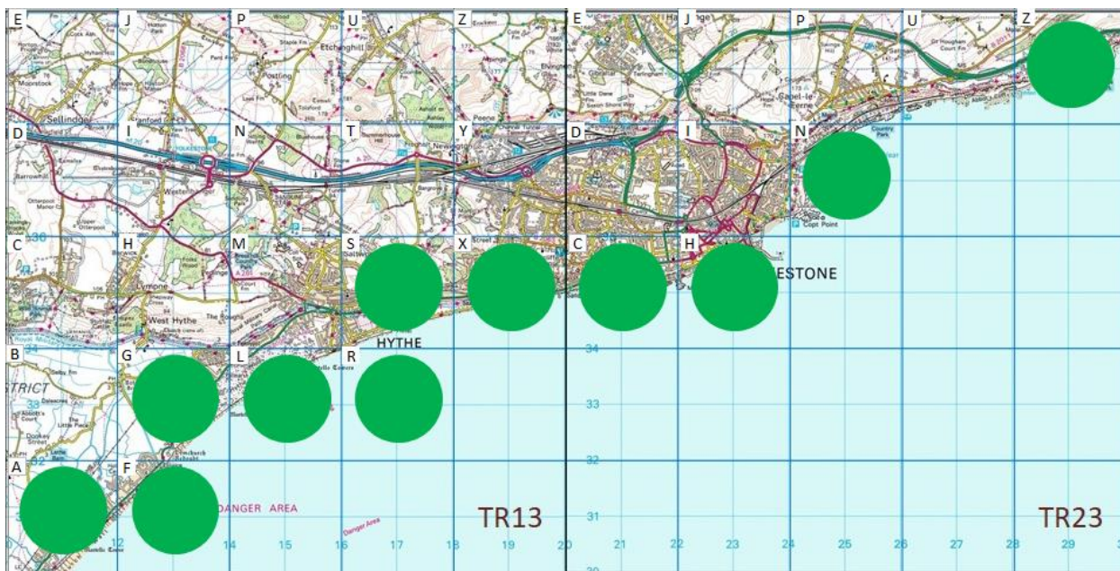
Figure 3: Distribution of all Avocet records at Folkestone and Hythe by tetrad

Figure 3 shows the distribution of records by tetrad, with sightings in 11 (35%) of tetrads. Nickolls Quarry is still the site that has produced the most records (with 21) but only one of those has occurred since 2006 (when the habitat became less attractive to waders). Almost all the other records are coastal, with 14 at Copt Point, 14 at Samphire Hoe, 11 at Mill Point/Folkestone Beach and 13 between Sandgate and the Willop Outfall. There have also been two records from the flooded fields at the Willop Basin.