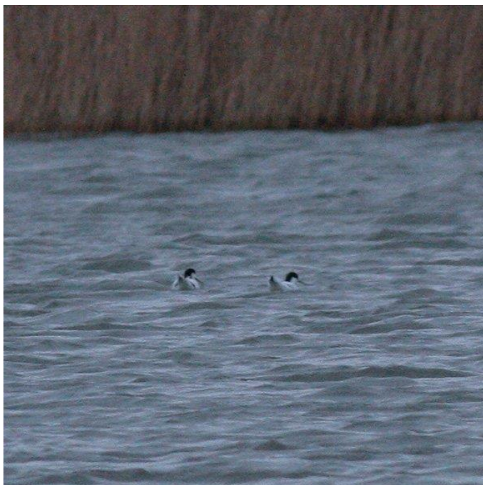
Avocets at Nickolls Quarry