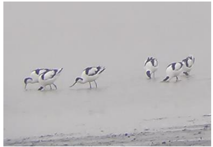
Avocets at the Willop Basin (Brian Harper)

A well scattered and localised breeding species across Europe. Declined in the north-west of the continent in the nineteenth century but recovered in the twentieth, with quite a rapid increase in the latter part of that century, particularly in Britain and the Netherlands. Migratory in the northern part of the breeding range, grading to dispersive in the south. British-bred birds generally remain within the country in winter, though there is a movement mainly of East Anglian birds to the south-west of England (Snow & Perrins, 1998).