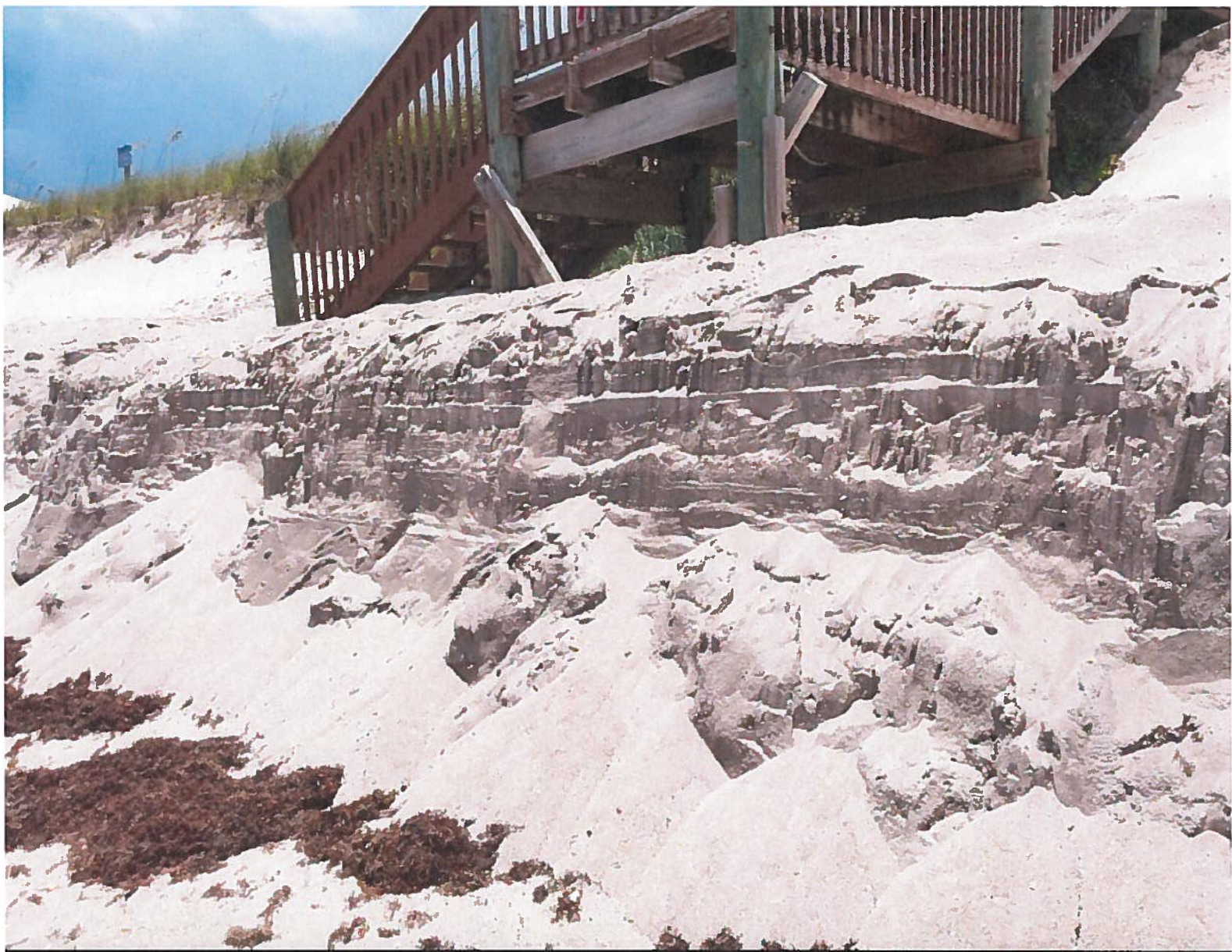
Photo Taken: 06/30/19 Lost Apporx. 4ft In Height By 15ft In Width In 24- hours.