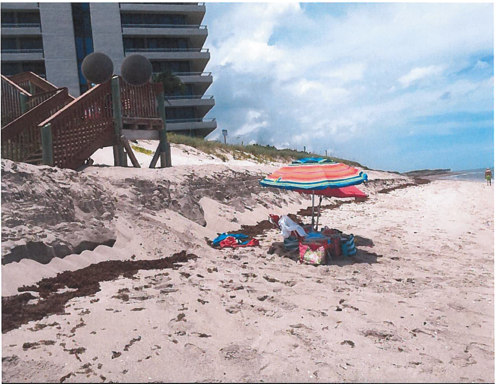
Photo Taken: 06/30/19 Lost Apporx. 4ft In Height By 15ft In Width In 24- hours.