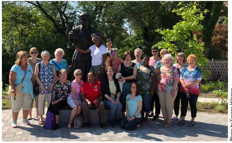
USAME participants pose with a statue of Harriet Tubman prior to visiting the New York State Heritage Center.

Well Chosen Words brochure provides inclusive language for people and expansive language for God and can be found on the Google site and website.