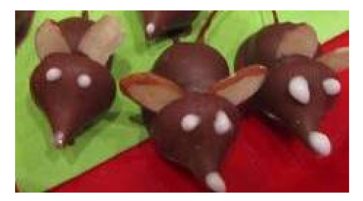
...And they were good!!!