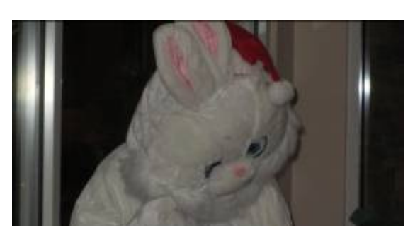
You've been Very Naughty