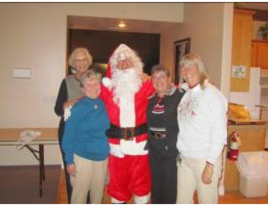
They've been Nice