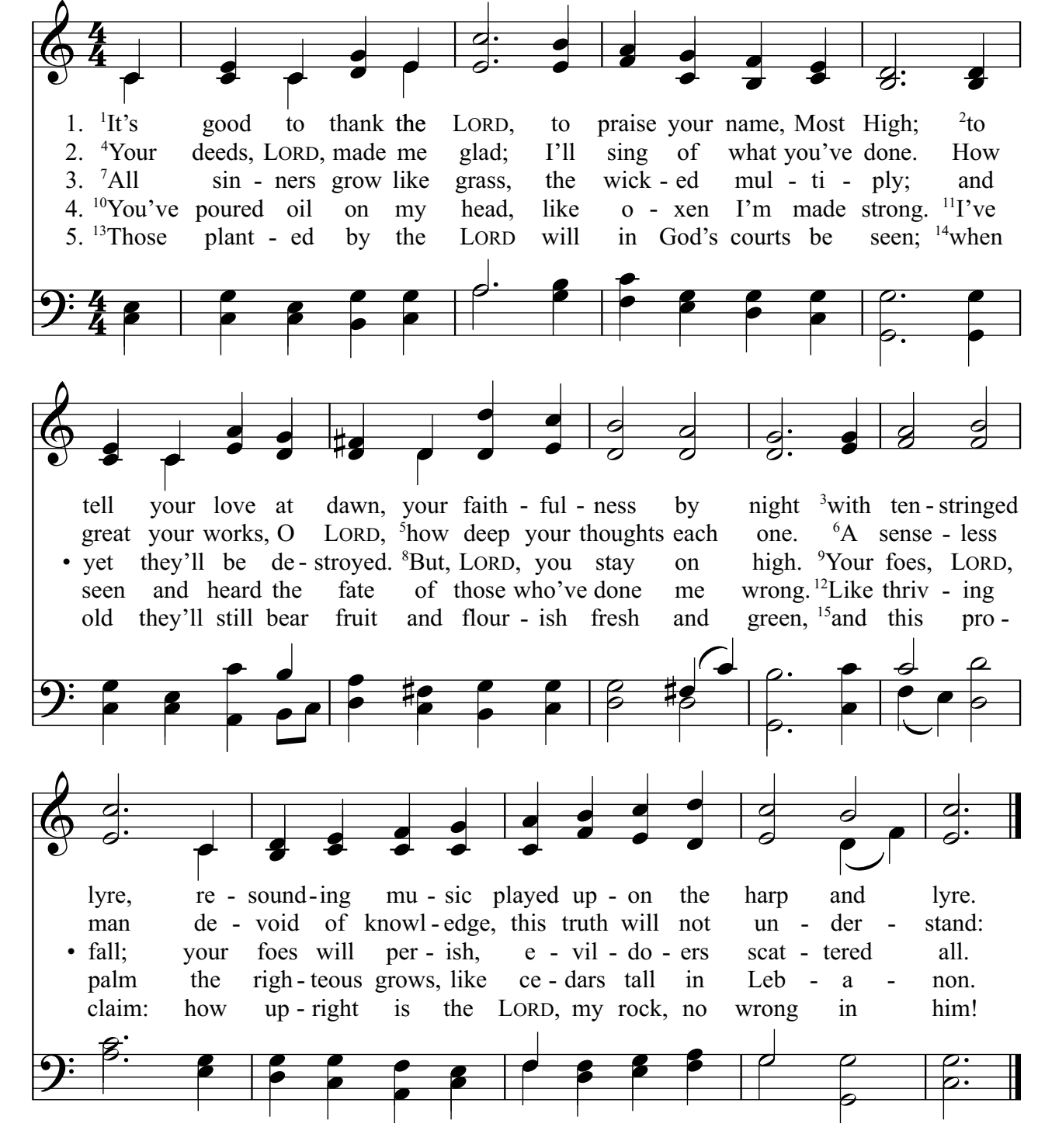
Psalm 92 © 2018 Orthodox Presbyterian Church and United Reformed Church Trinity Psalter Hymnal Joint Venture. CCLI 487914 CCLI #487914