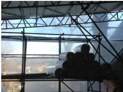
Coping stones around the Rector's Vestry appear to be remarkable similar to those high up on the Tower.

Simon the joiner fixing the plywood onto the roof spars ready for the stainless sheets to go on.