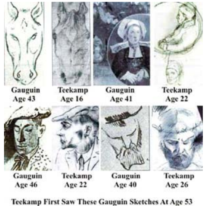
Teekamp First Saw These Gauguin Sketches At Age 53