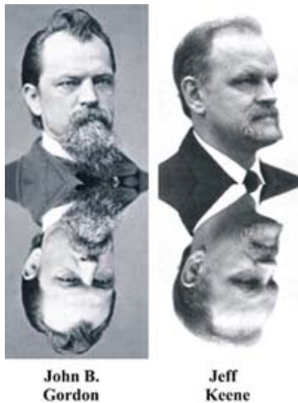
John B. Gordon