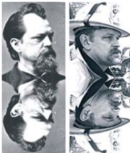
John B. Gordon