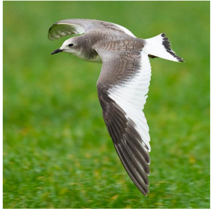
Sabine's Gull at Port Lympne