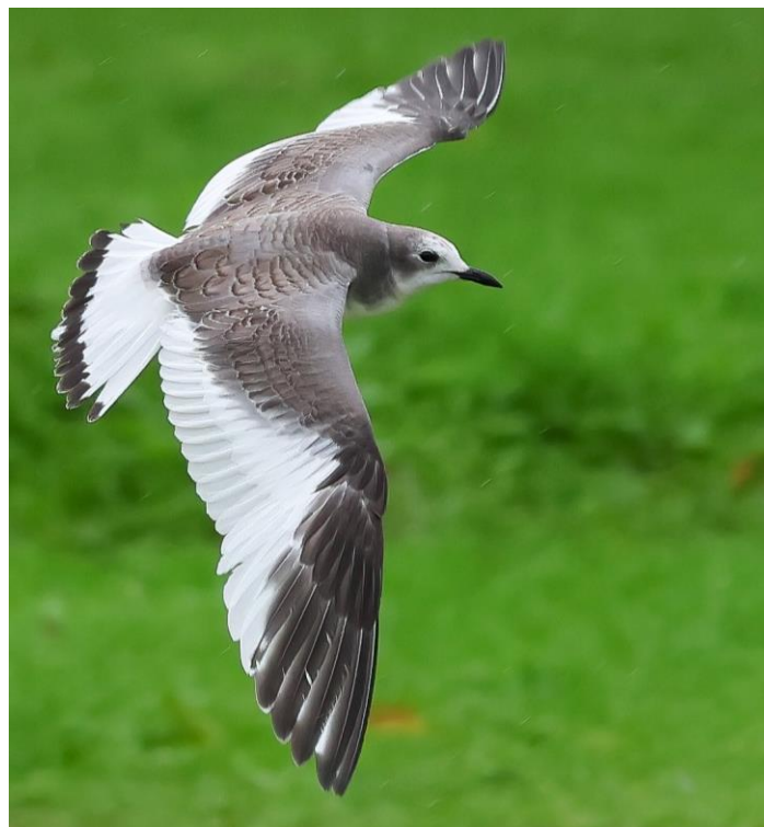
Sabine's Gull at Port Lympe (Simon King)