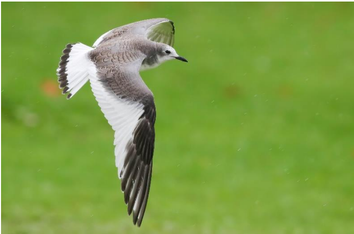
Sabine's Gull at Port Lympe (Ashley Howe)