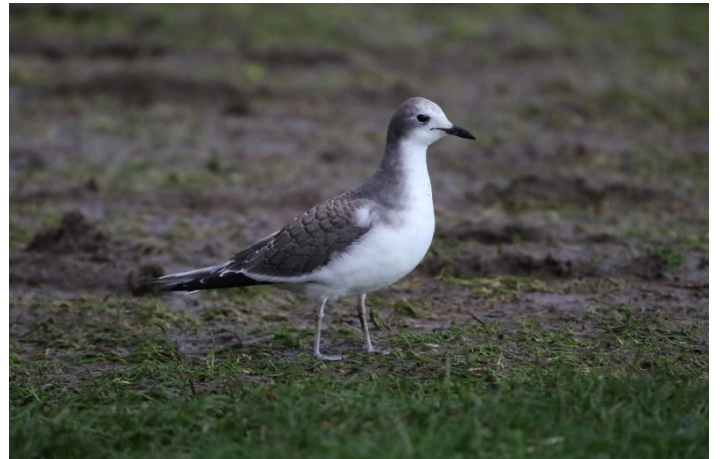
Sabine's Gull at Port Lympe (Ian Roberts)