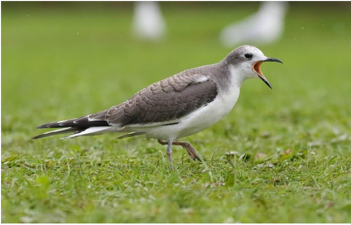
Sabine's Gull at Port Lympne