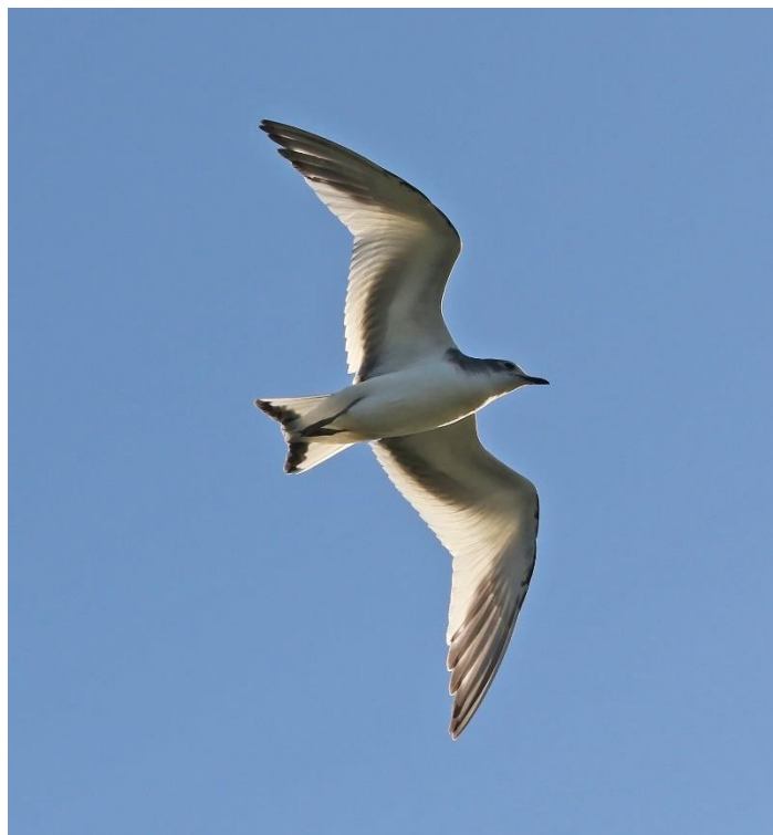
Sabine's Gull at Port Lympe (Trevor Ellery)