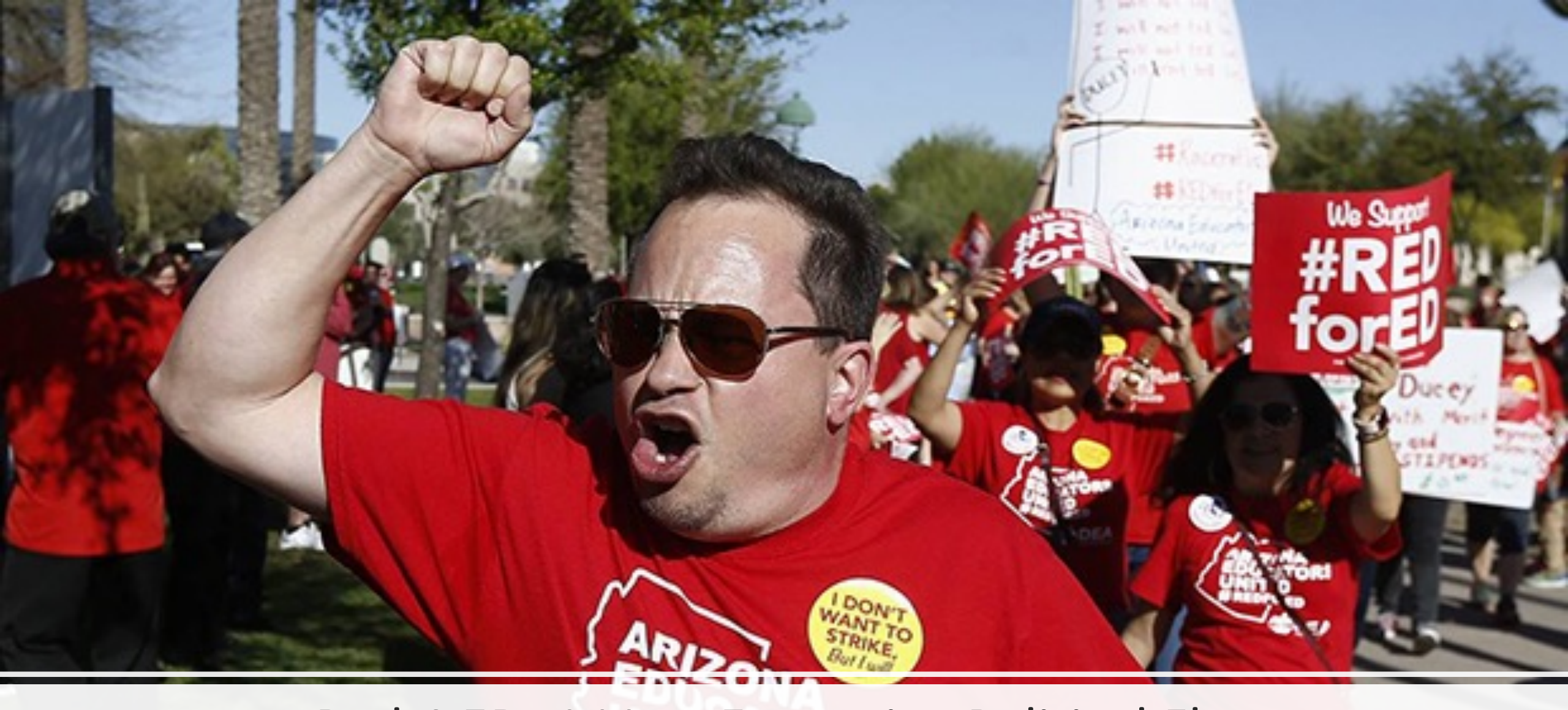
Red 4 ED: A Very Expensive Political Flop