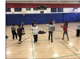
Community Self Defense Class

Providing programming by hosting free community self defense classes at local City of Columbus Recreation Center.