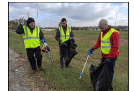
Community Cleanup ECBA

Participating in Community Clean Up days with ECBA-East Columbus Business Association. Beautifying our neighborhoods and community corridors.