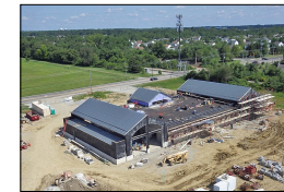
Firestation 35 Waggoner Rd

Continuing to bring City services such as the much needed Fire Station 35 to the Far East Side alleviating strained response times from the area's rapid growth.