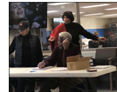
Firefighters4Kids Barnett Center

Serving our community by registering thousands of Eastside families with Firefighters4Kids. Connecting families with social services and city resources at our Far East Neighborhood Pride Center.