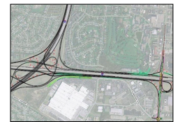
Far East Freeway Project Phase 1

After a decade of advocating for this project, beginning in 2022 the first phase of the Far East Freeway Project awarded by ODOT will begin, helping with safety of travelers and easing congestion.