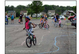
Safety Town Neighborhood Pride

Partnering with city programs, CPD, Neighborhood Pride and Columbus Neighborhood & Community Grants to bring a day of safety to our neighborhoods. Fitting kids with new bike helmets and giving safety talks.