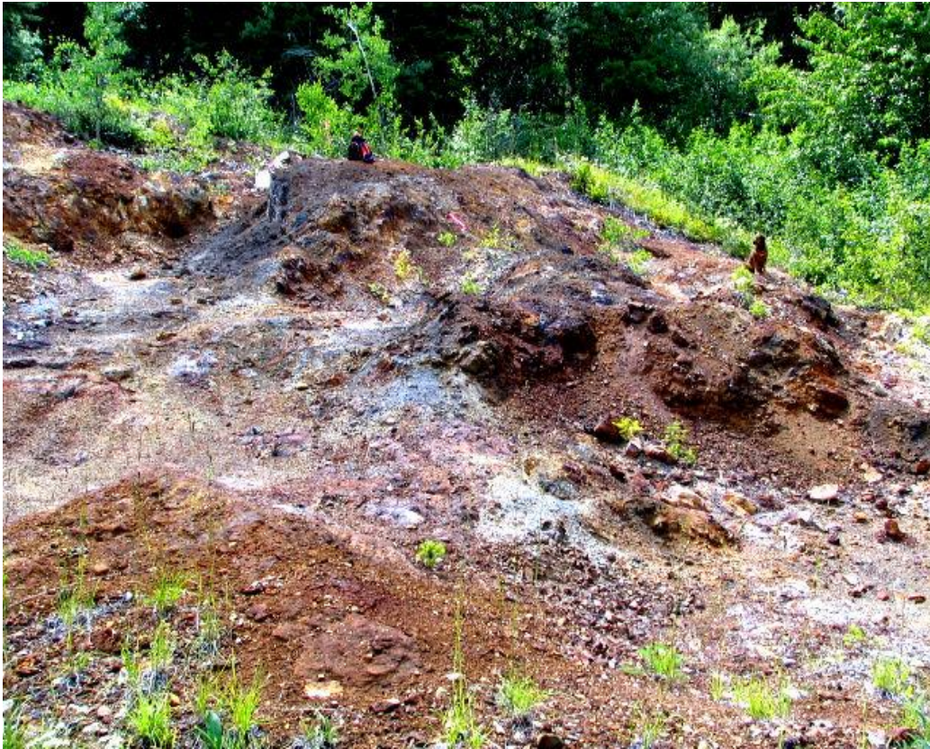
NORTH HORSE STRIPPED AREA- MASSIVE SULPHIDE – Au-Ag-Cu-Co