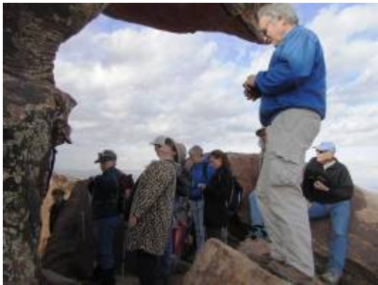
Figure 1a Figure 1b