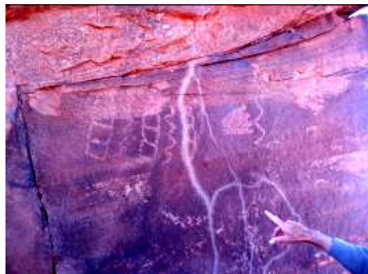
Figure 4 Figure 5