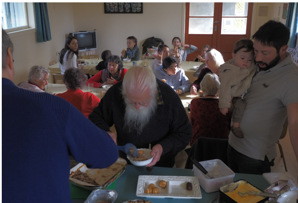
shared lunch after celebration of Pentecost, at the premises of Mobile Mission Maintenance (MMM).