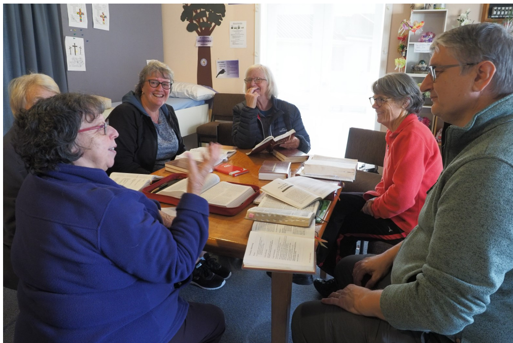
St Saviours Friday Study Group