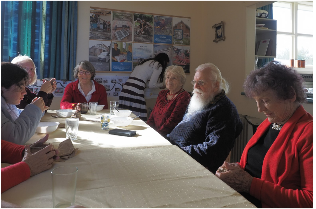
shared lunch after celebration of Pentecost, at the premises of Mobile Mission Maintenance (MMM).