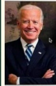
Thanks to President Joe Biden