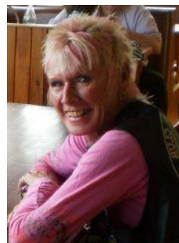
RIP Pinkie' #35902

We encourage all members to come along, and wear pink as a sign of respect. The Branch is looking at providing a pink ribbon for you to wear, but please feel free to wear your pink shirts. In Kiwi's words "This is going to give his girl a wonderful sendoff" .