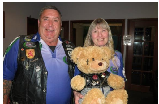
Awards: The Goth received the "Mishap award" for falling off her bike not once but three times.