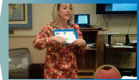
Professional Development for Teachers

apluslit@gmail.com www.aplusliteracy.com