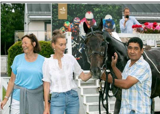
We Got The Boss