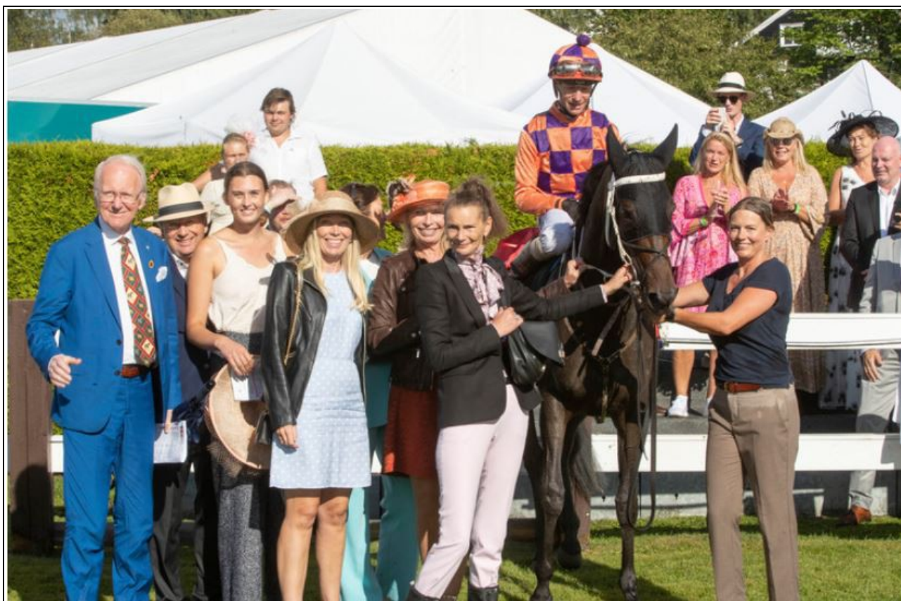
I Rest My Case with connections on Derby day '22.

I Rest My Case became the highest earning horse in Norway in 2022, with NOK 775,849 from eight runs. She just edged out her stable companion Hard One To Please on this list, as his domestic earnings were NOK 725,000 from four runs. Hard One To Please would probably get most votes if we decided to crown a Scandinavian Horse of The Year, and perhaps it's about time to get those Scandinavian stats back up and running? He earned NOK 2,812,764 all told – and he also became the highest earner in Sweden this year. His fellow Väsby Häst flag bearer Youonlyliveonce sits in tenth place on the list of top earners in Norway this year, with NOK. 322,600 from 11 starts that yielded 2 wins and six other top three efforts.