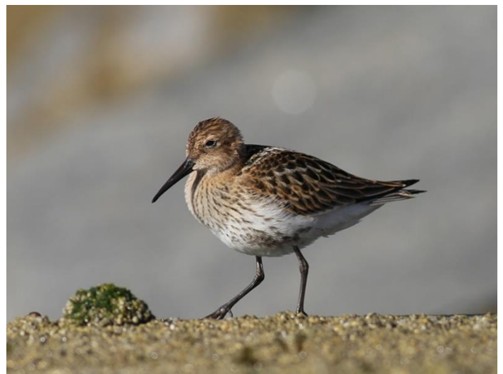
Dunlin at the Dymchurch Redoubt (Brian Harper)

Few were noted at Nickolls Quarry in October or November, with a total of just 35 bird/days between 1995 and 2005, but there were counts of four on the 1 st November 1998 and the 2 nd October 2003. Coastal sites however have produced much larger counts during this period, with totals of 25 or more logged on nine occasions: