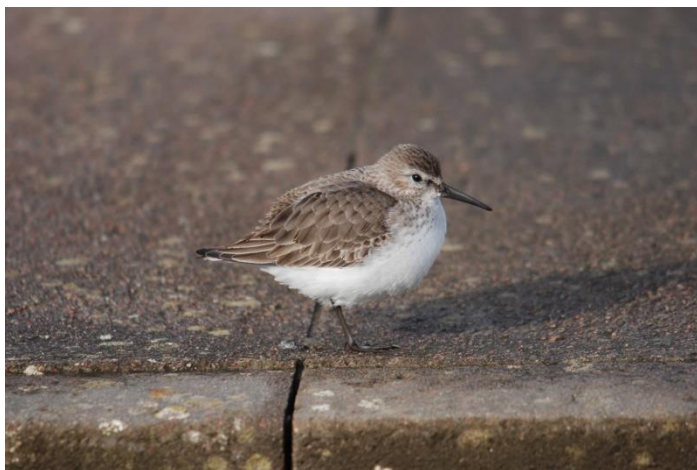
Dunlin at Samphire Hoe