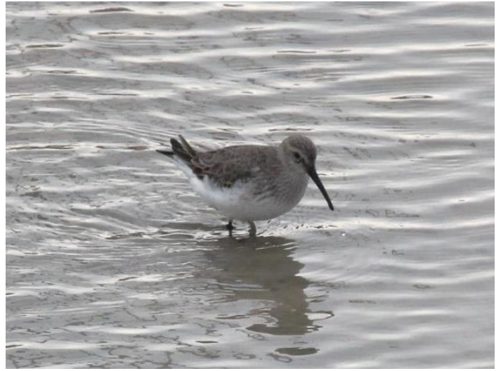
Dunlin at Folkestone Harbour