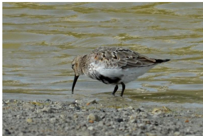
Dunlin at Samphire Hoe