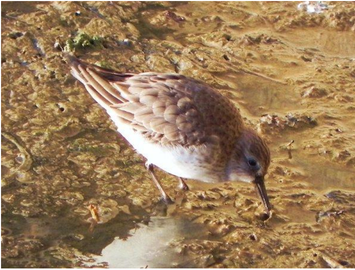
Dunlin at Botolph's Bridge (Nick Hollands)

Almost all records are from the coast or within an adjacent 1km tetrad however two were flushed from Beachborough Lakes on the 12 th October 2017.