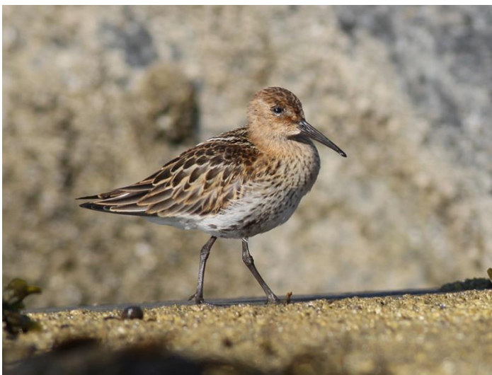
Dunlin at the Dymchurch Redoubt (Brian Harper)

Elsewhere small numbers may be noted from July, mostly at coastal sites and usually passing at sea or occasionally heard on nocturnal passage. Only singles have been recorded in July, with the exception of two flying east past Copt Point on the 26 th July 1999, but August has produced counts of seven flying east past Hythe on the 1 st August 2016, eight flying west past Copt Point on the 26 th August 2003 and eight flying east at Abbotscliffe on the 30 th August 1993, whilst in September seven flew east past Samphire Hoe on the 28 th September 2007, ten flew west there on the 5 th September 2006 and an exceptional total of 40 flew west there on the 11 th September 2005.