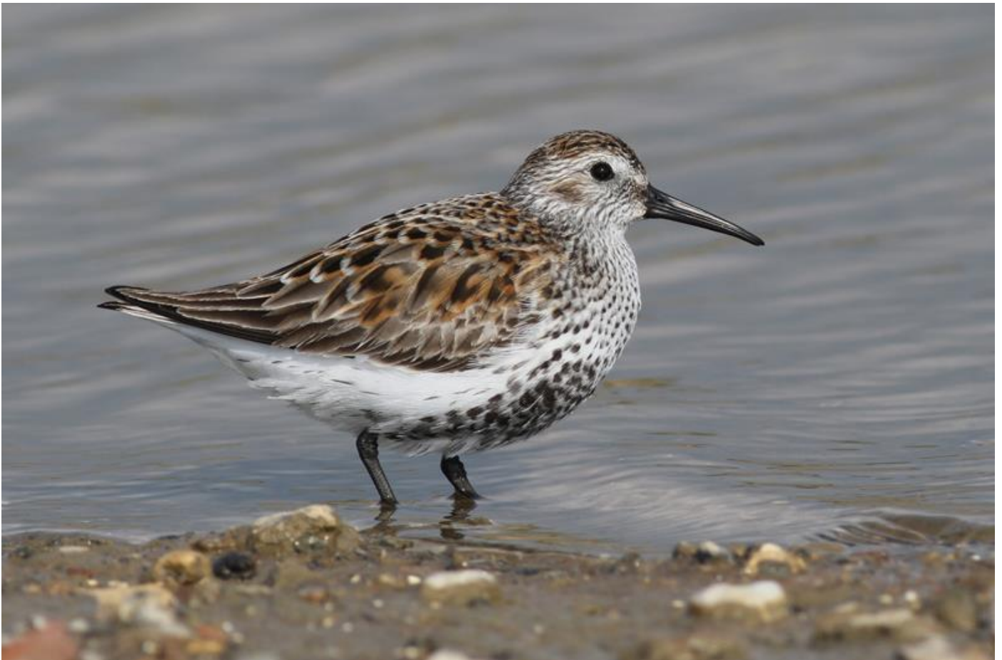
Dunlin at Nickolls Quarry