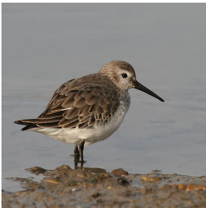
Dunlin at Botolph's Bridge (Brian Harper)

40 east past Copt Point on the 27 th Apr 2004 51 east past Copt Point on the 1 st May 2004 43 east past Copt Point on the 10 th May 2004 22 east past Samphire Hoe on the 16 th May 2008 22 east past Samphire Hoe on the 2 nd May 2012 23 east past Samphire Hoe on the 5 th May 2013 20 east past Hythe on the 26 th Apr 2015 22 east past Mill Point on the 4 th May 2020 30 east past Seabrook on the 8 th May 2021 23 east past Mill Point on the 22 nd April 2022