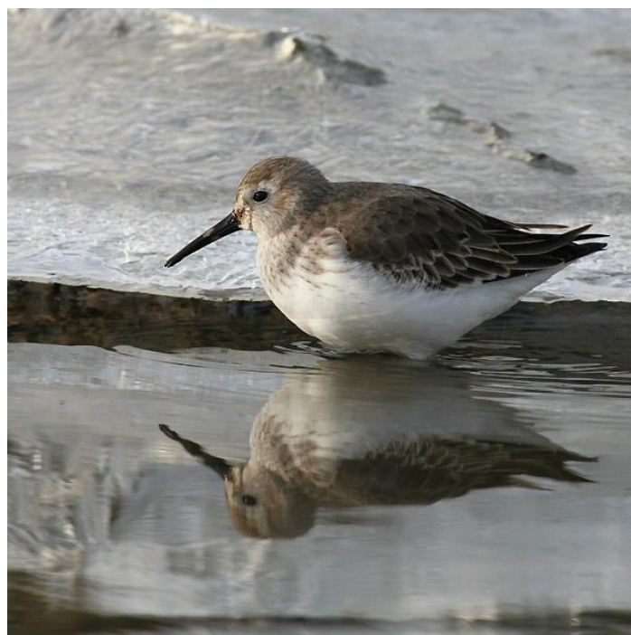
Dunlin at Botolph's Bridge