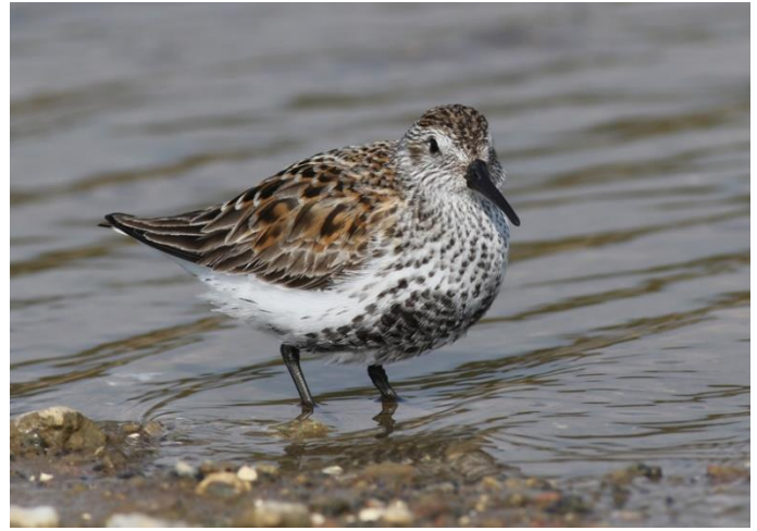
Dunlin at Nickolls Quarry

In Kent it is a common passage migrant and winter visitor, which is scarce inland.