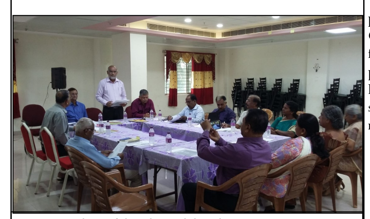
Members of the Silver Jubilee Planning Committee

These are our ambitious plans and we propose to work for it from January 2020.