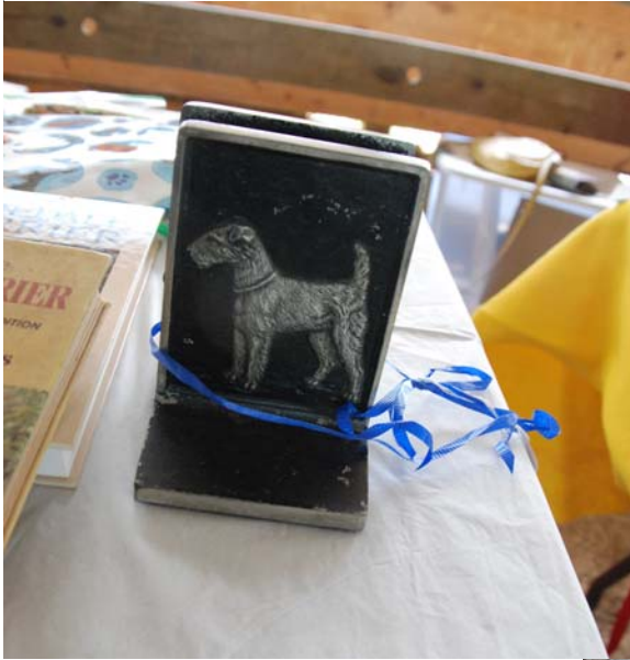
Beautiful items for sale to benefit Rescue.