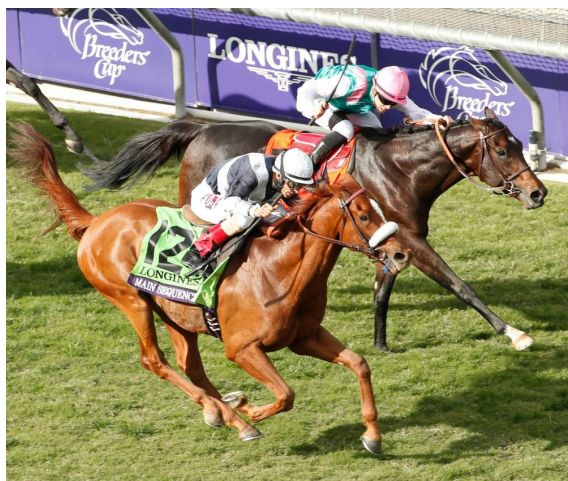
Main Sequence (12) and Flintshire, 1-2 in the Breeders' Cup Turf, may meet again in the Sheema.

AVANTI BELLO BAD READ SANCHEZ BATTLE OF MARATHON GALICADO MAFTOOL MASTERMIND REN ENGLAND ROYAL NAVY SHIP SIR FEVER SMUGGLER'S COVE STORMY LIBERAL TANSEI LAVISH TANNAAF TAP THAT THE MANAGEMENT WAR DISPATCH WAR ENVOY