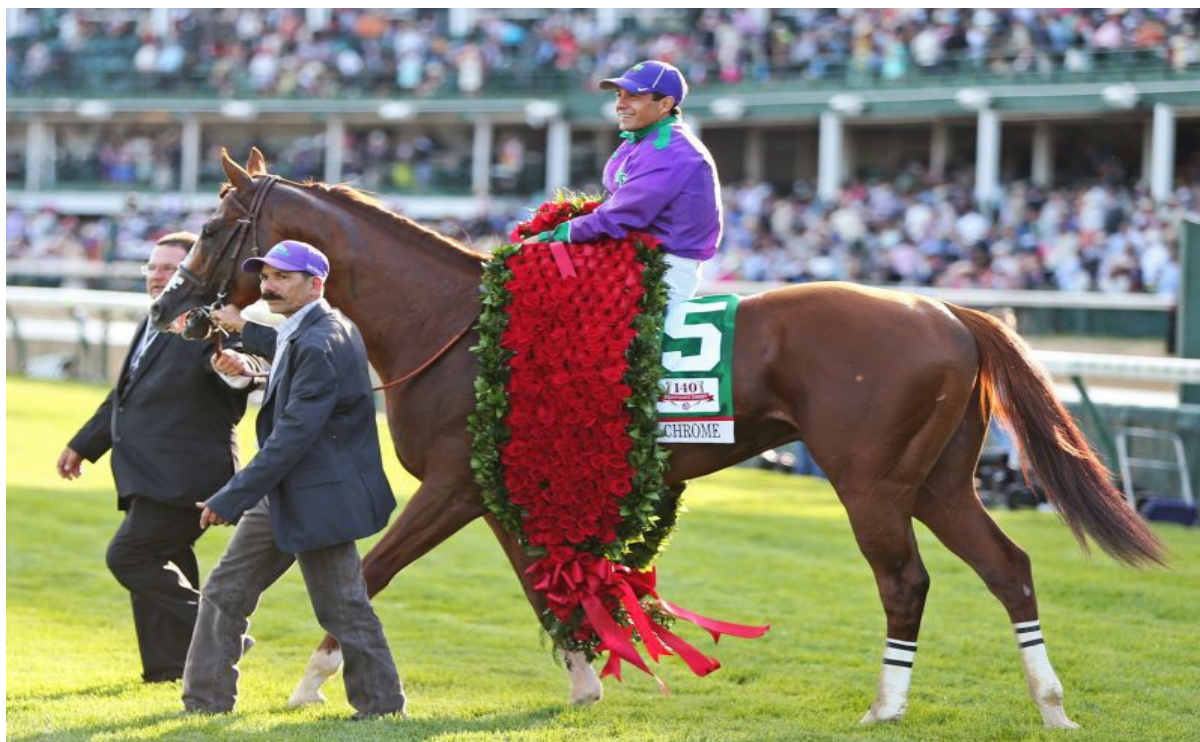
Kentucky Derby winners; California Chrome and Victor Espinoza