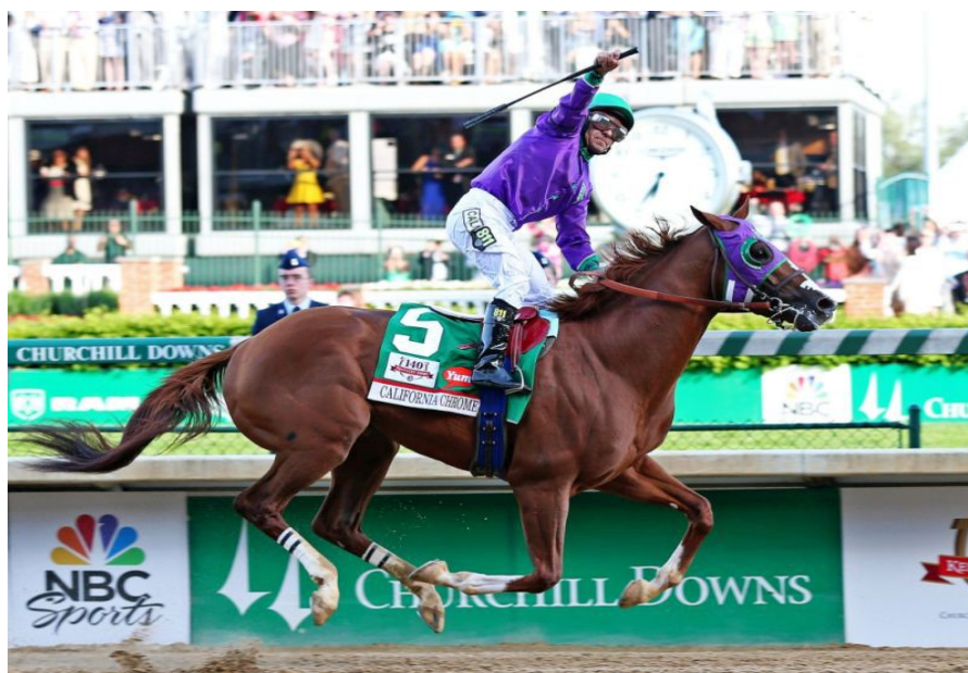
Passing the winning post at Churchill Downs

Bayern won again, though this time by no more than a nose, beating English raider Toast Of New York in a thrilling finish. California Chrome was just a neck behind in third place. He was back. No doubt about that, and when his connections took the unusual route to a top level turf race to round off his campaign, it was a shrewd move in securing votes for Horse of The Year. It worked out to perfection. Chrome had no problems with the surface switch, as he won the Hollywood Derby (G1) with ease – and in January he was on the top of the podium at the annual Eclipse Awards. Retirement and a lucrative stud career was never even discussed. After all, his team have been having fun all along this fantastic journey, and his mother's name was Love The Chase. That's exactly what he appears to be doing.