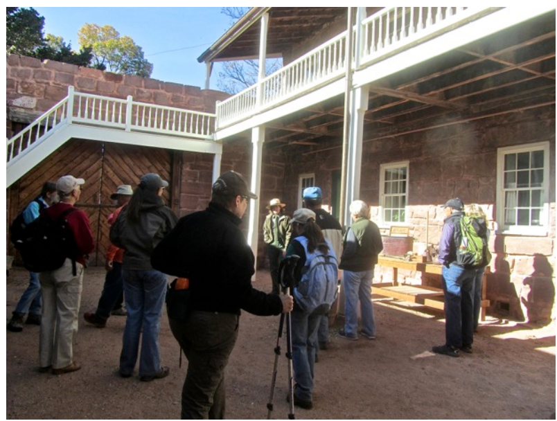
The courtyard in Winsor Castle