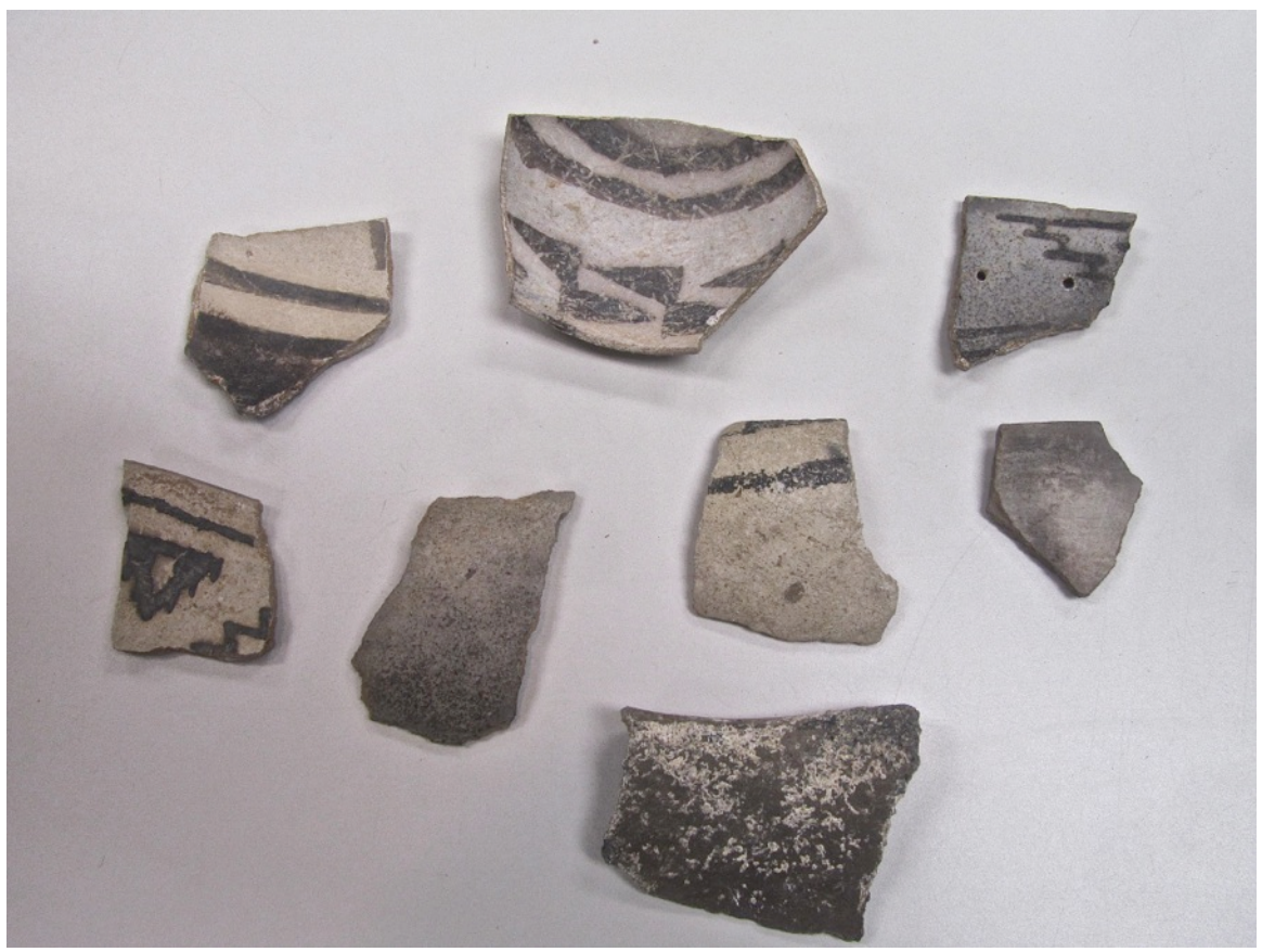
Example of pottery shards found at the Archaeology park site.

http://dixierockart.webs.com/Technical%20Presentations/Proposal%20for%20an%20Arc haeology%20Park%20-%20Greg%20Woodall%20-%20November%202014.pdf to see complete report.