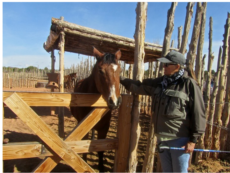
The livestock at Pipe Spring