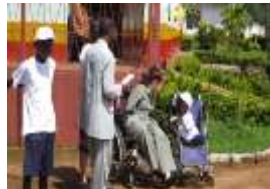
Irente School for the Blind