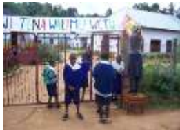
Irente Rainbow School

TOUR OPTION #1: The Irente area. Irente is an area just outside of Lushoto Town. On this full day tour (Thursday, July 18) you will visit the following locations: Irente Children’s Home, Irente School for the Blind, Irente Rainbow School for children with special needs, Irente Farm (for a farm fresh lunch) and Irente Viewpoint. The total cost will be $20.00 USD per individual for vehicle, fuel, driver, meals and soft drinks.