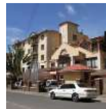
New Safari Hotel - Arusha

In Arusha – The New Safari Hotel http://newsafarihotel.com/ This is most easily booked via booking.com. They have the availability of airport pickup and delivery for a fee. You will need to e-mail in advance for this service.