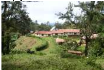
Lutindi Mental Hospital

This full day tour will take you through the countryside and literally to the top of a mountain where the hospital and tea farm are located. The scenery is breathtaking. This hospital was built in 1896, as a home for children of slaves. After a few years it was repurposed to be a hospital for people with mental disabilities as there was a great need for psychiatric treatment in Tanzania. It is the oldest psychiatric Hospital in East Africa