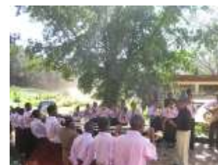
Brass Band Reception

You will be welcomed with local music and honored local officials. Since you will most likely have been traveling great distances during the day, you will be brought to your chosen lodging sites upon arriving to Lushoto. You will have a few minutes to get checked in and settled. You will then be transported to SEKOMU for the Welcome Reception. This will be about an hour and will provide you with fancy hors d'oeuvres so you will not need to order dinner once you return to your lodging location. Please keep in mind this is in North Eastern Tanzania. Food is prepared once your order is placed. The preparation of your food can take some time as it is prepared from scratch. Dr. Anneth Munga, chairperson for the Local Planning Committee will greet you and welcome you to Tanzania and to Sebastian Kolowa Memorial University and to the 2019 IASE Conference.