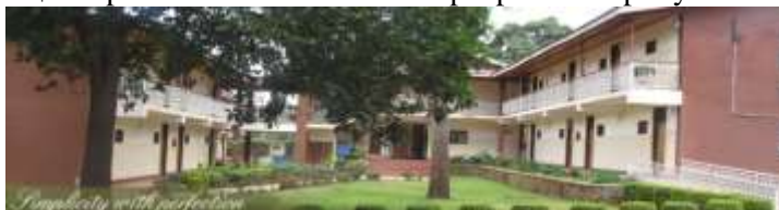
Lutheran Hostel at Uhuru

In Moshi – Lutheran Uhuru Hotel http://www.uhuruhotel.org Here they are offering a 5% room rate discount as long as you identify you are attending the 2019 IASE Conference at SEKOMU. They also have a pickup service from Mt. Kilimanjaro International Airport. They have a variety of size vehicles from 2 persons up to 15 people at a time. Their price range is from $50 USD to $110 per vehicle and number of people in the party. Please email ahead if you need this service.