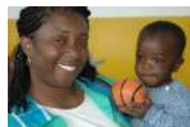
Irente Children's Home