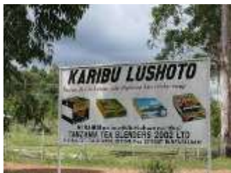
Welcome to Lushoto

For those of you who will be traveling with your family and/or friends who will not be attending the Conference, there are many things to do in the area. These can be taken advantage of whether you are staying in Lushoto or on the campus in Magamba.