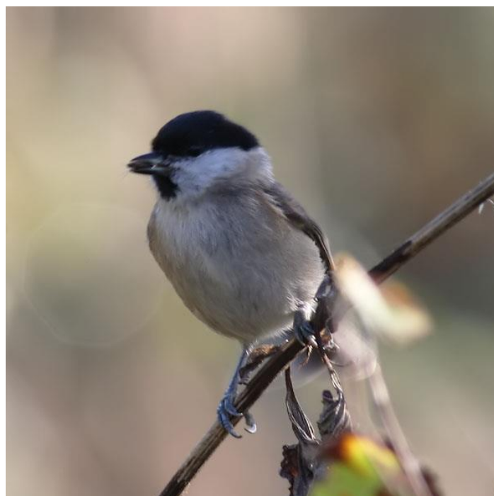
Marsh Tit at West Hythe