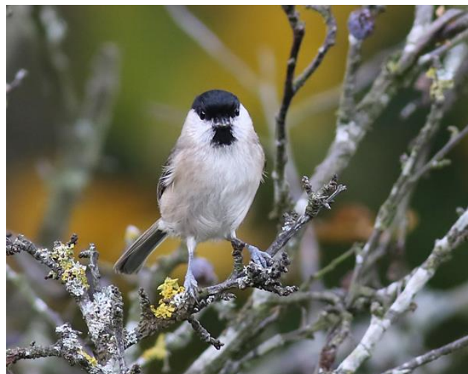
Marsh Tit at Paraker Wood

A thinly distributed and apparently declining resident in Kent.