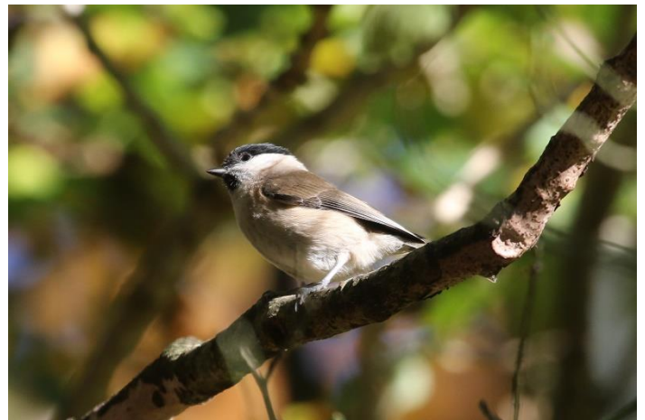
Marsh Tit at Chesterfield Wood

Click here to listen to a local audio recording of one calling at Cowtye Wood on the 23 rd November 2014.