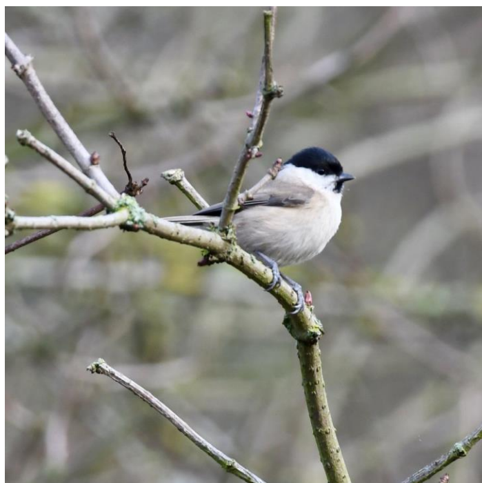
Marsh Tit at Paraker Wood

Few estimates of breeding population have been recorded but six pairs held territory at Sandling Park in 1974, which suggests presence at a higher density than today.