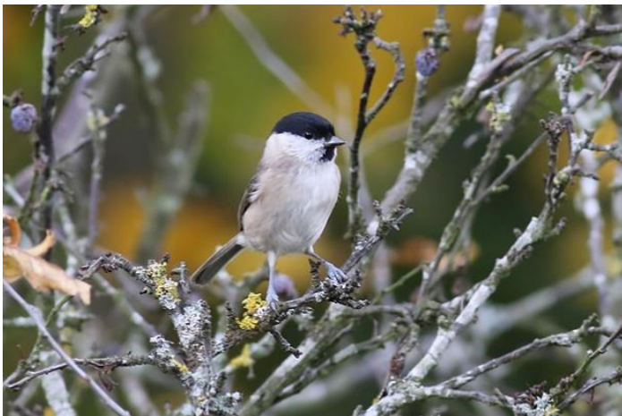
Marsh Tit at Paraker Wood (Brian Harper)

There have been no indications of passage, with no records from well-watched coastal sites such as Samphire Hoe, Abbotscliffe or Mill Point. A single record at Nickolls Quarry (in the trees bordering the Botolph's Bridge Road) on the 26 th October 1999 is worthy of note, and perhaps wandered with a tit flock from Lymgne Park Wood.